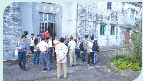
蒲台、石鼓洲、大澳及鹿湖 / 羌山 Po Toi, Shek Kwu Chau, Tai O and Luk Wu/Keung Shan