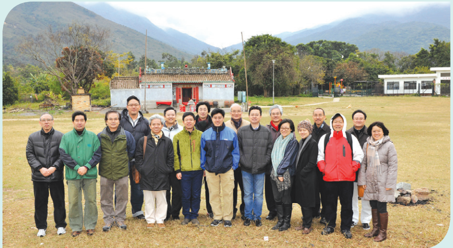
南丫島 Lamma Island