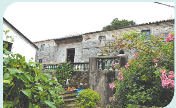
蓮麻坑、蠔殼圍及白沙澳 Lin Ma Hang, Hoo Hok Wai and Pak Sha O