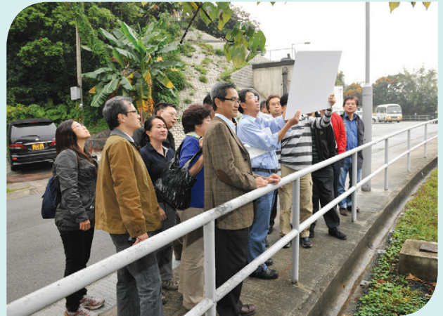
荔枝窩、沙頭角、皇后山及火炭 Lai Chi Wo, Sha Tau Kok, Queen's Hill and Fo Tan