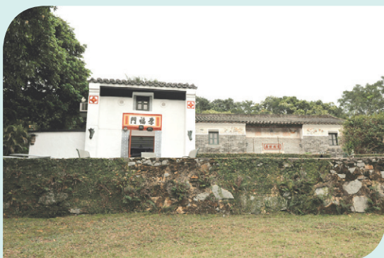
蓮麻坑、蠔殼圍及白沙澳 Lin Ma Hang, Hoo Hok Wai and Pak Sha O