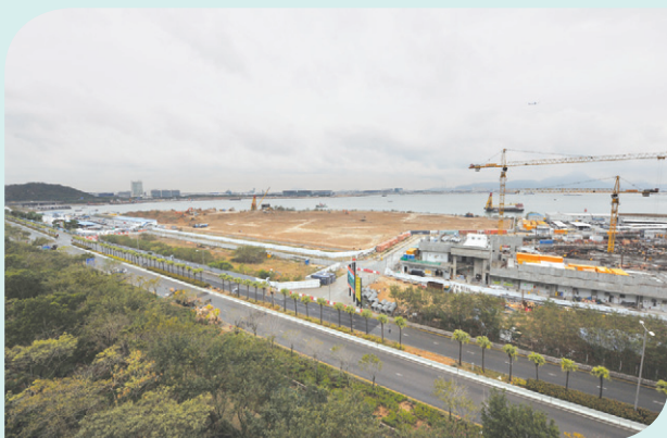
東涌 Tung Chung