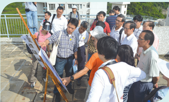
蒲台、石鼓洲、大澳及鹿湖 / 羌山 Po Toi, Shek Kwu Chau, Tai O and Luk Wu/Keung Shan