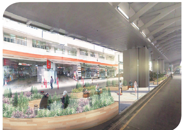
建議優化後的九龍城街道環境 Proposed Streetscape Enhancement in Kowloon City