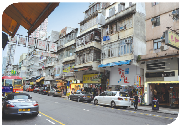
獅子石道 Lion Rock Road