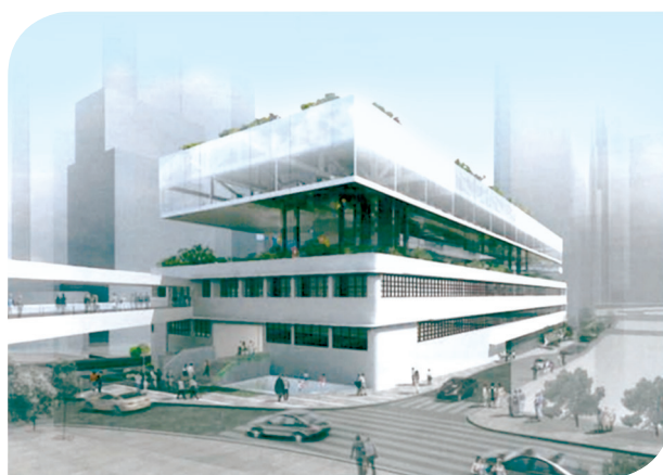
擬議的「城中綠洲」 Proposed 'Central Oasis'