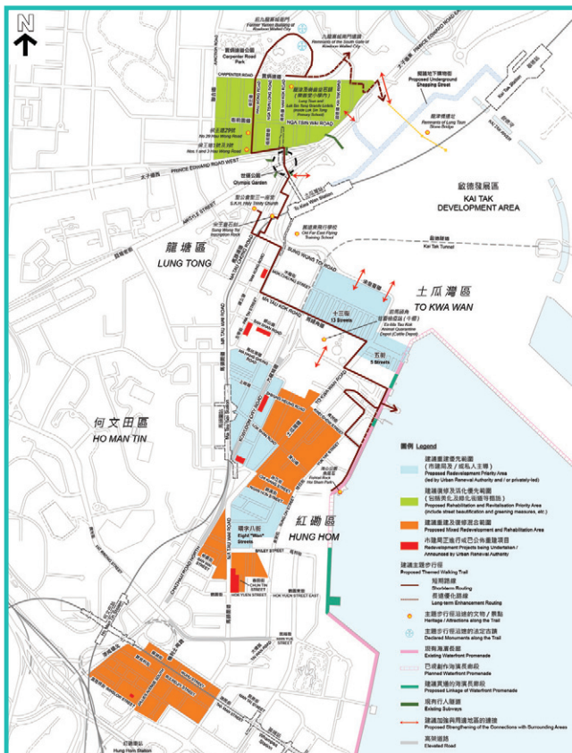
建議的九龍城市區更新計劃 Recommended Urban Renewal Plan for Kowloon City

The first pilot DURF was established in KC in June 2011 and was tasked to advise the Government on an URP for KC which has a large number of dilapidated buildings.