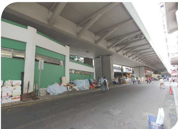
九龍城現時街道環境 Existing Streetscape in Kowloon City