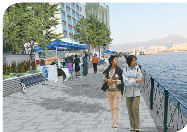
九龍城擴闊海濱長廊建議 Proposed Waterfront Promenade Widening in Kowloon City