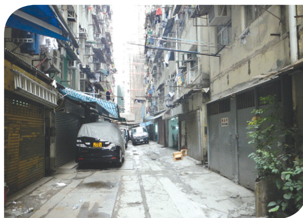
環字八街 Eight "Wan" Streets