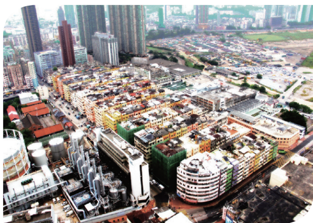
「十三街」 "13 streets"

The URP for KC was submitted to the Government in January 2014. The term of the KC DURF ended in May 2014.