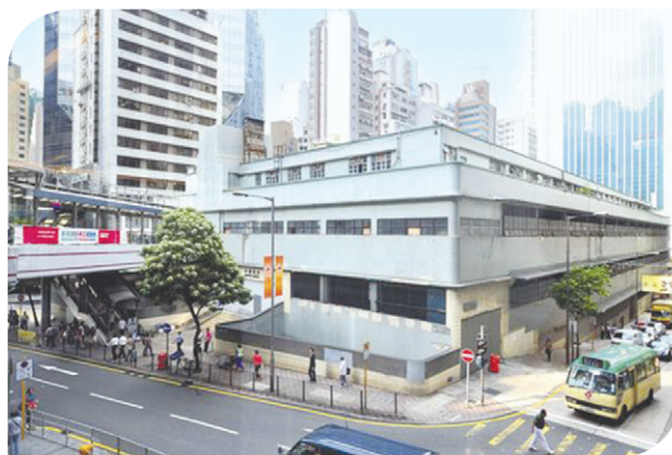
中環街市 Central Market

On 19 July 2013, the Board approved a planning application (No. A/H4/92) with conditions for proposed new additions to the building for cultural/leisure/recreational/food and beverage/retail uses/landscaped area/ancillary support and minor relaxation of building height restriction to revitalise the Central Market into a low-rise leisure landmark named ‘Central Oasis’. The development of ‘Central Oasis’ will be divided into two phases to maintain the operation of the public passageway at the second floor within the building connecting the Mid-levels Escalator and the elevated walkway networks at the harbourfront. A ‘Landscape Atrium’ with no permanent structures other than landscape and architectural features and an ‘Urban Floating Oasis’ to accommodate diversified cultural, recreational, leisure, food and beverage, and retail uses for public enjoyment, as well as to support another layer of POS were proposed.