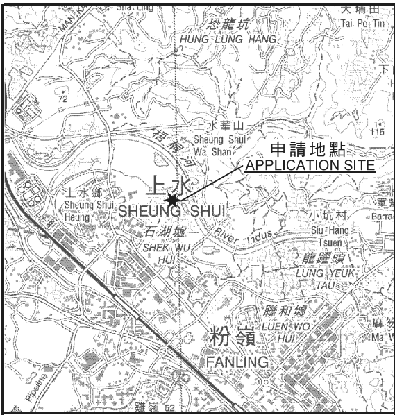
要覽圖 KEY PLAN