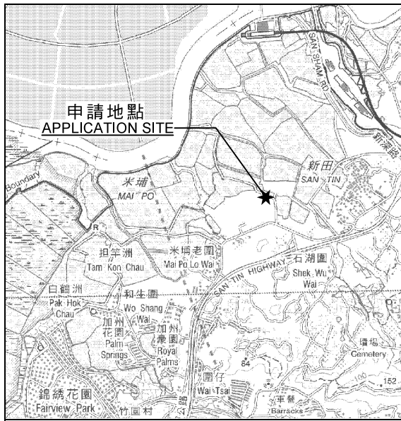
要覽圖 KEY PLAN