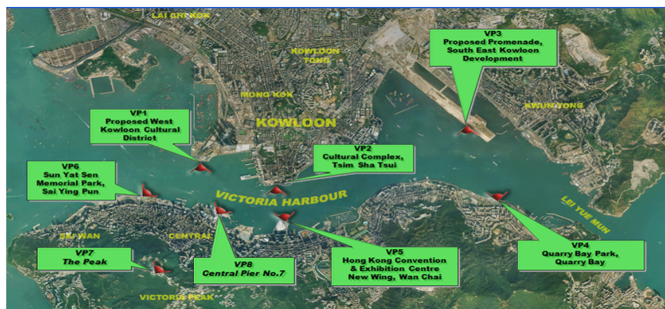
Diagram 2: Strategic View Points as per Ch. 11 Urban Design Guidelines