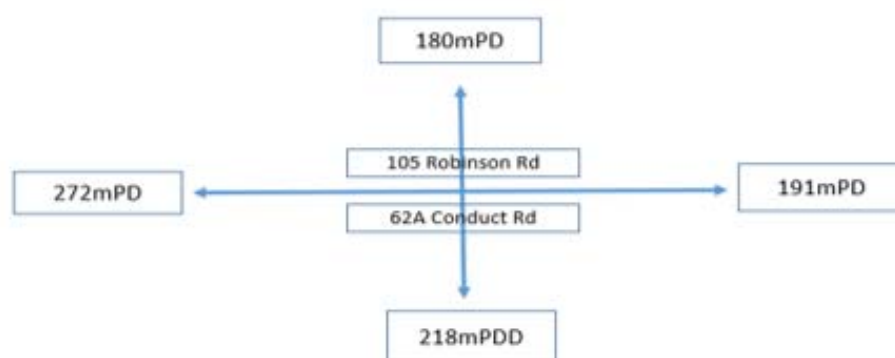
Diagram 1: Nearest tall buildings surrounding subject site