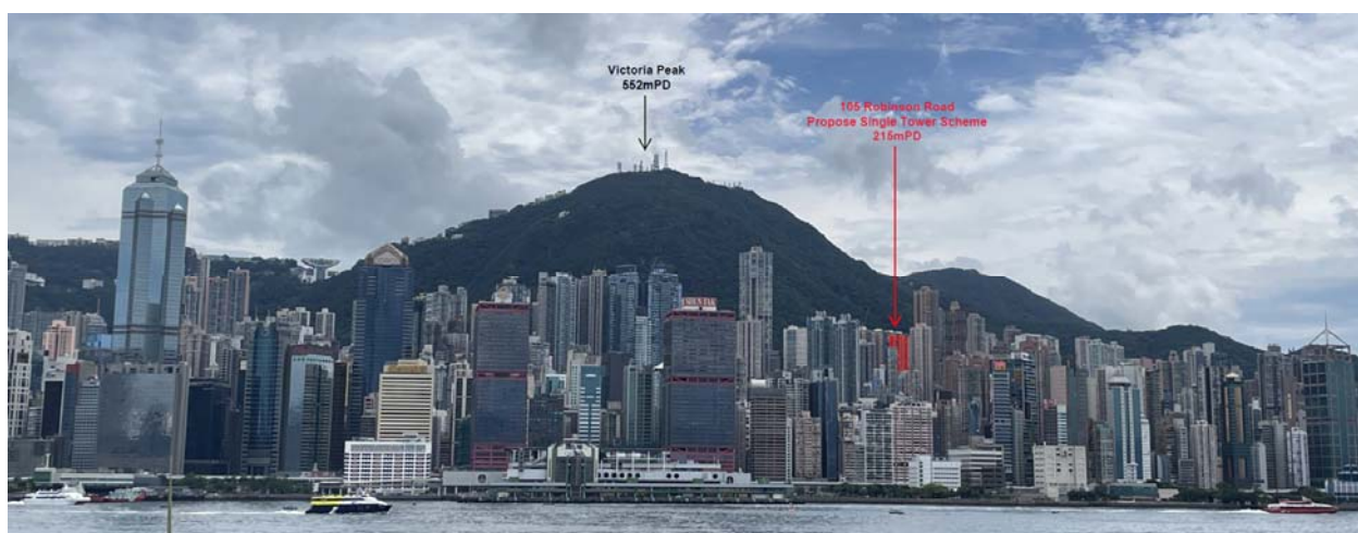
Diagram 3: Elevated Strategic View Point at VP1 (Diagram 2)