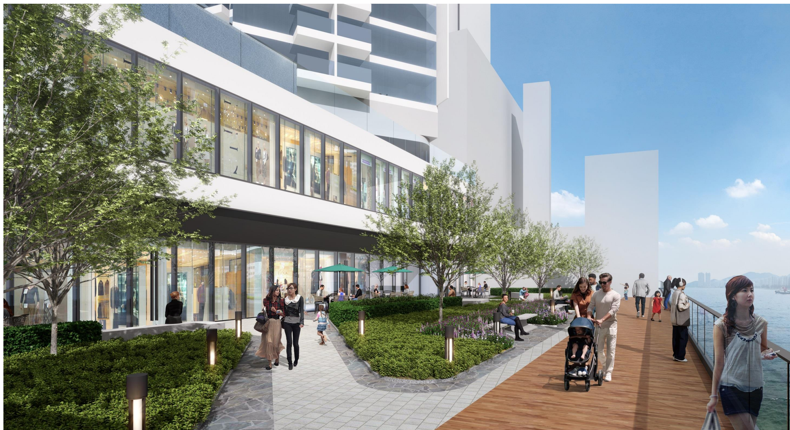
E-01 Illustration of Planning and Design Merits – Public Promenade

Proposed Residential & Commercial Development at No. 4 Tung Yuen Street, Yau Tong YTML 70