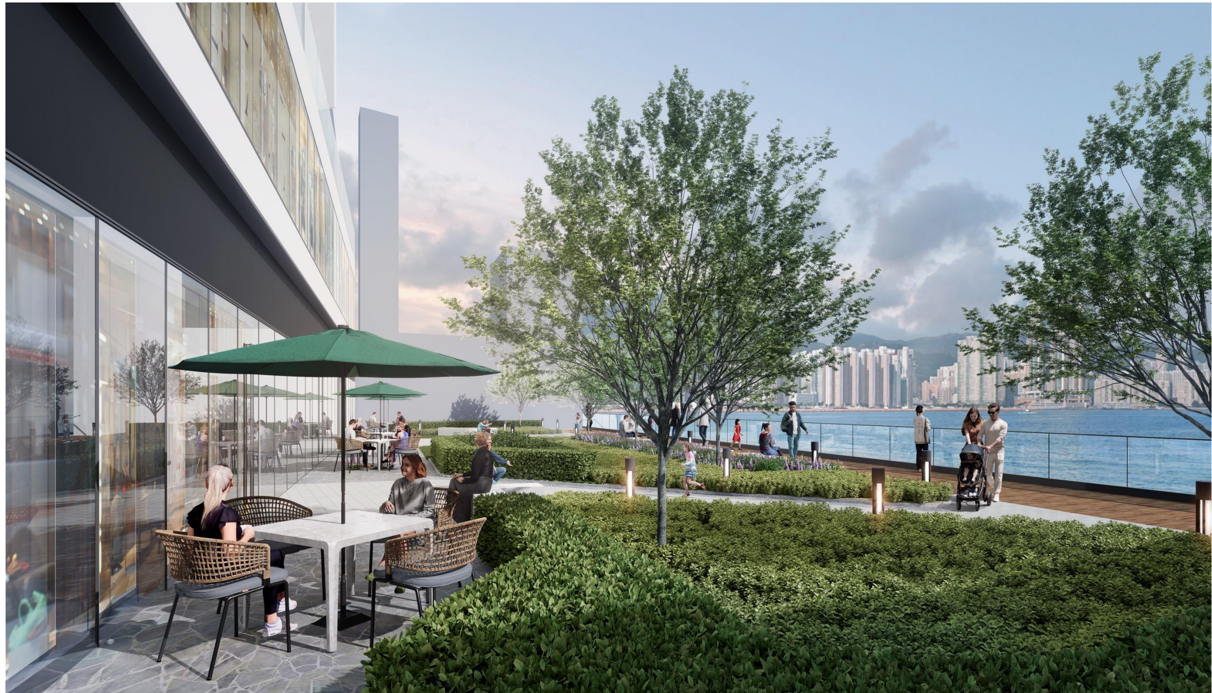
E-02 Illustration of Planning and Design Merits – Public Promenade

Proposed Residential & Commercial Development at No. 4 Tung Yuen Street, Yau Tong YTML 70