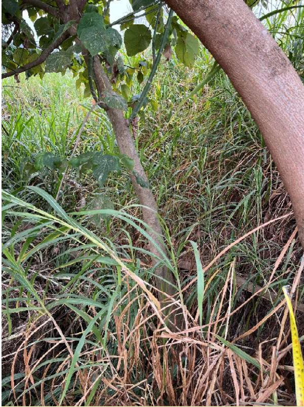
Figure 4 General View 01