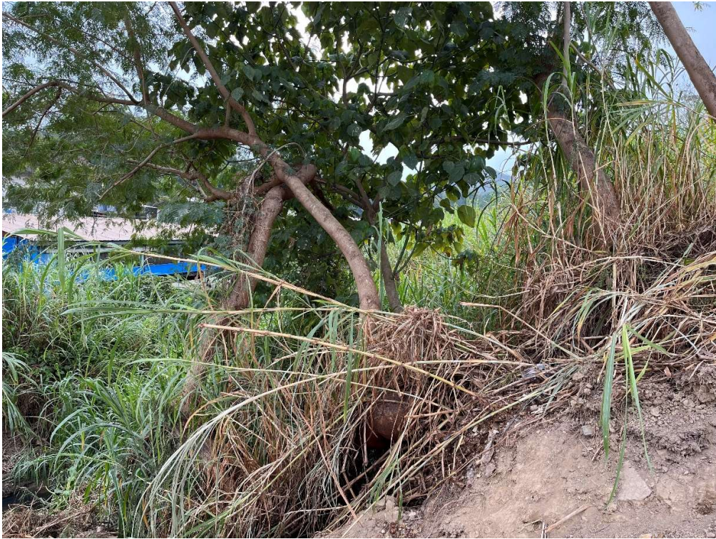
Figure 2a: Tree T2