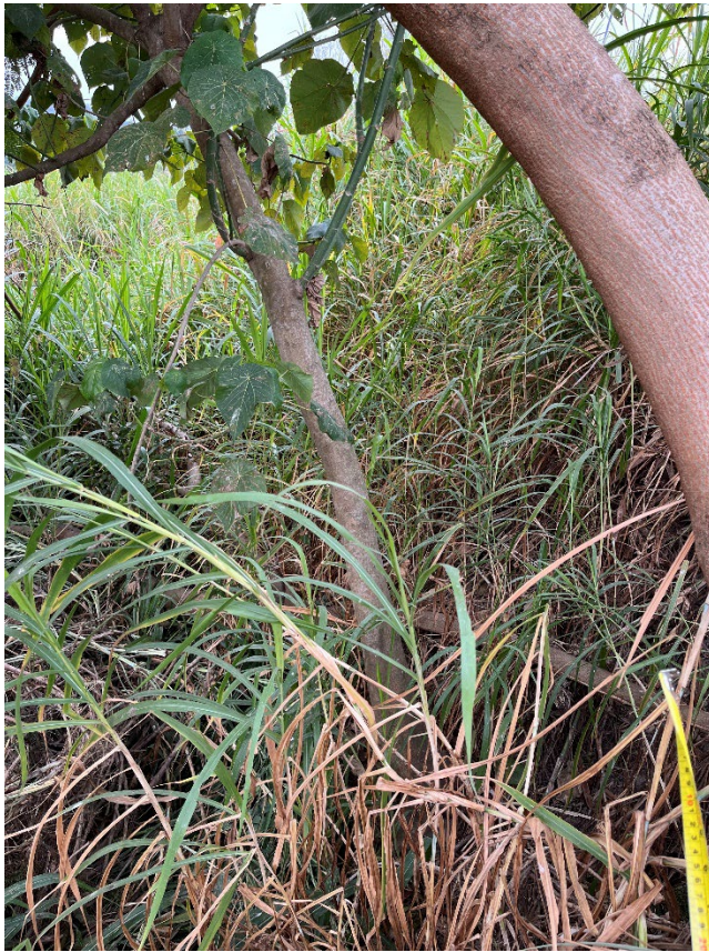
Figure 4 General View 01