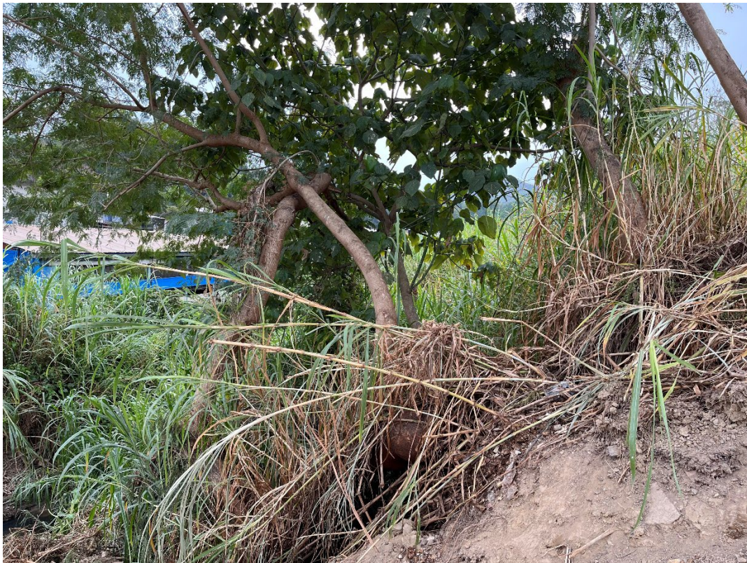
Figure 2a: Tree T2