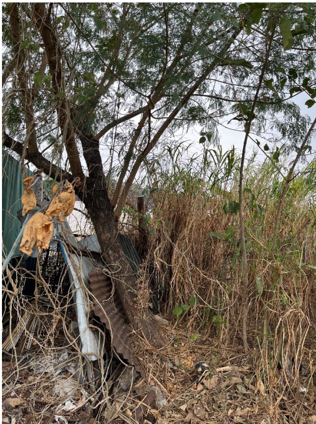
Figure 1: Tree T1