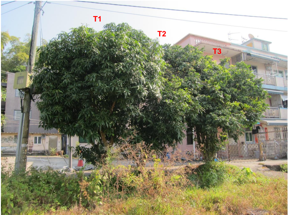
Photo of T1, T2 and T3