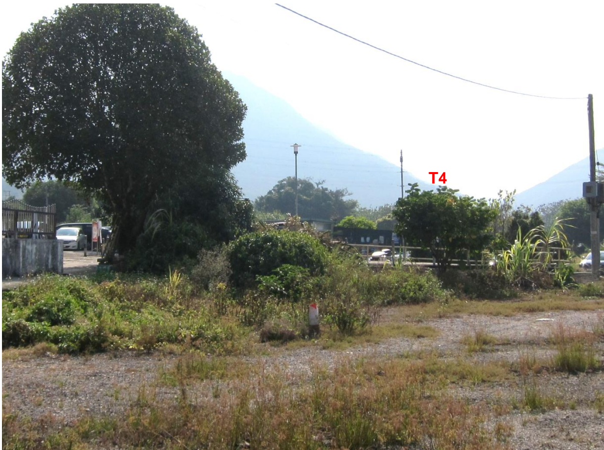
Photo of T4