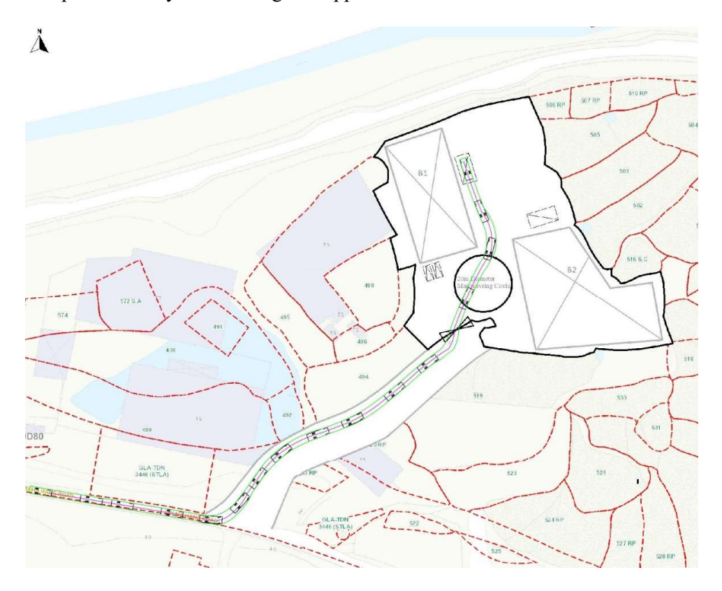
Swept Path Analysis: Entering the Application Site 2