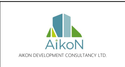
Figure: 5 Scale: Not to Scale Date: Aug 2024

Title: Indicative Layout Plan Ref.: ADCL/PLG-10286-R001/F005