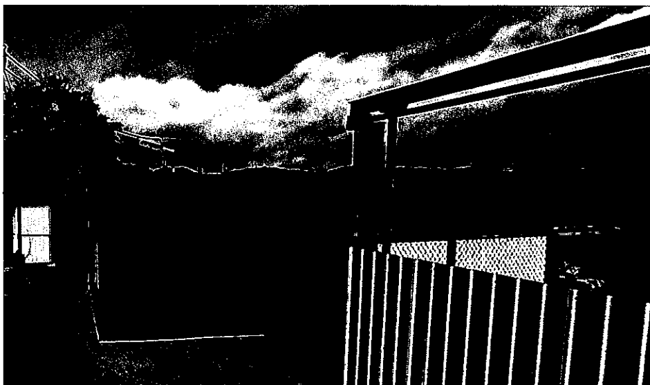
Figure 6. The East side of Lot Nos. 497, 498, 499 and 500 in D.D. 87