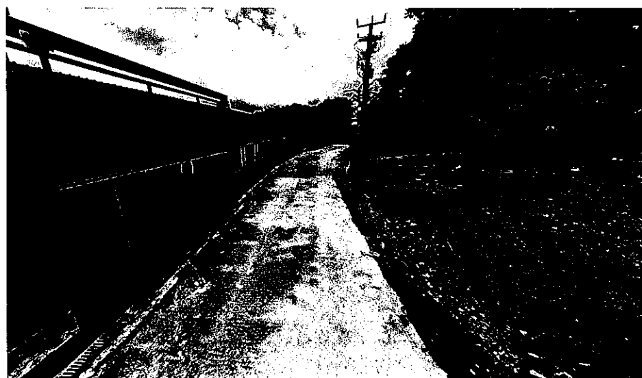
Figure 7. The South side of Lot Nos. 497, 498, 499 and 500 in D.D. 87