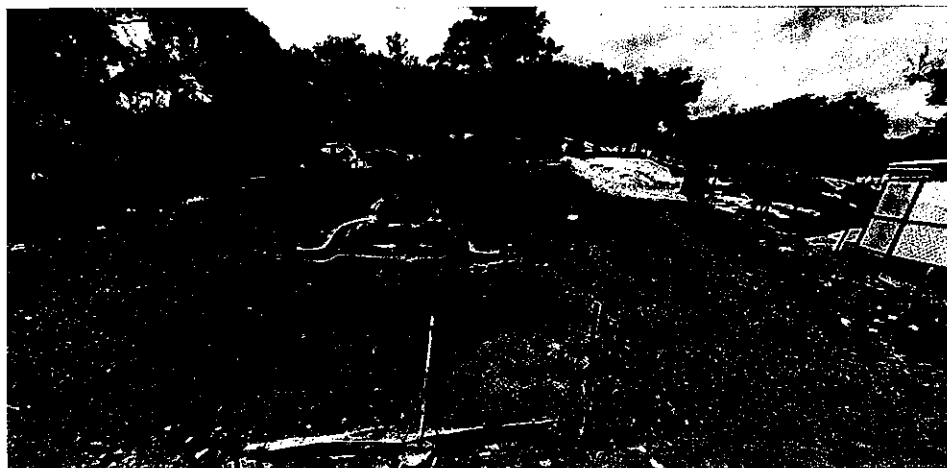
Figure 5. The West side of Lot Nos. 497, 498, 499 and 500 in D.D. 87