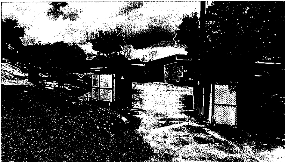
Figure 4. The entrance of Lot Nos. 497, 498, 499 and 500 in D.D. 87