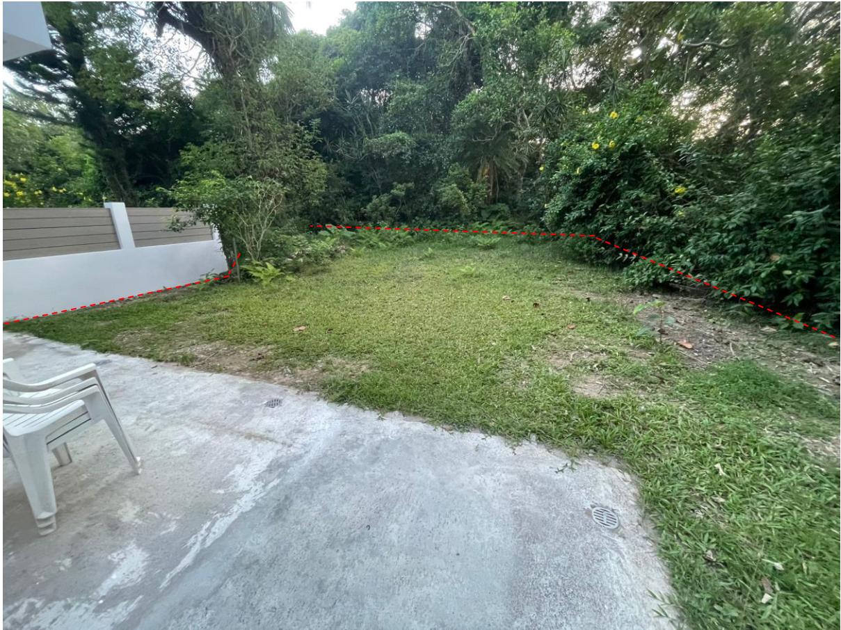
Photo 3: Shows the existing grass area which will be retained in the proposed garden. (Boundary line of the proposed STT are only indicative, please see the site plan for accurate boundary lines).