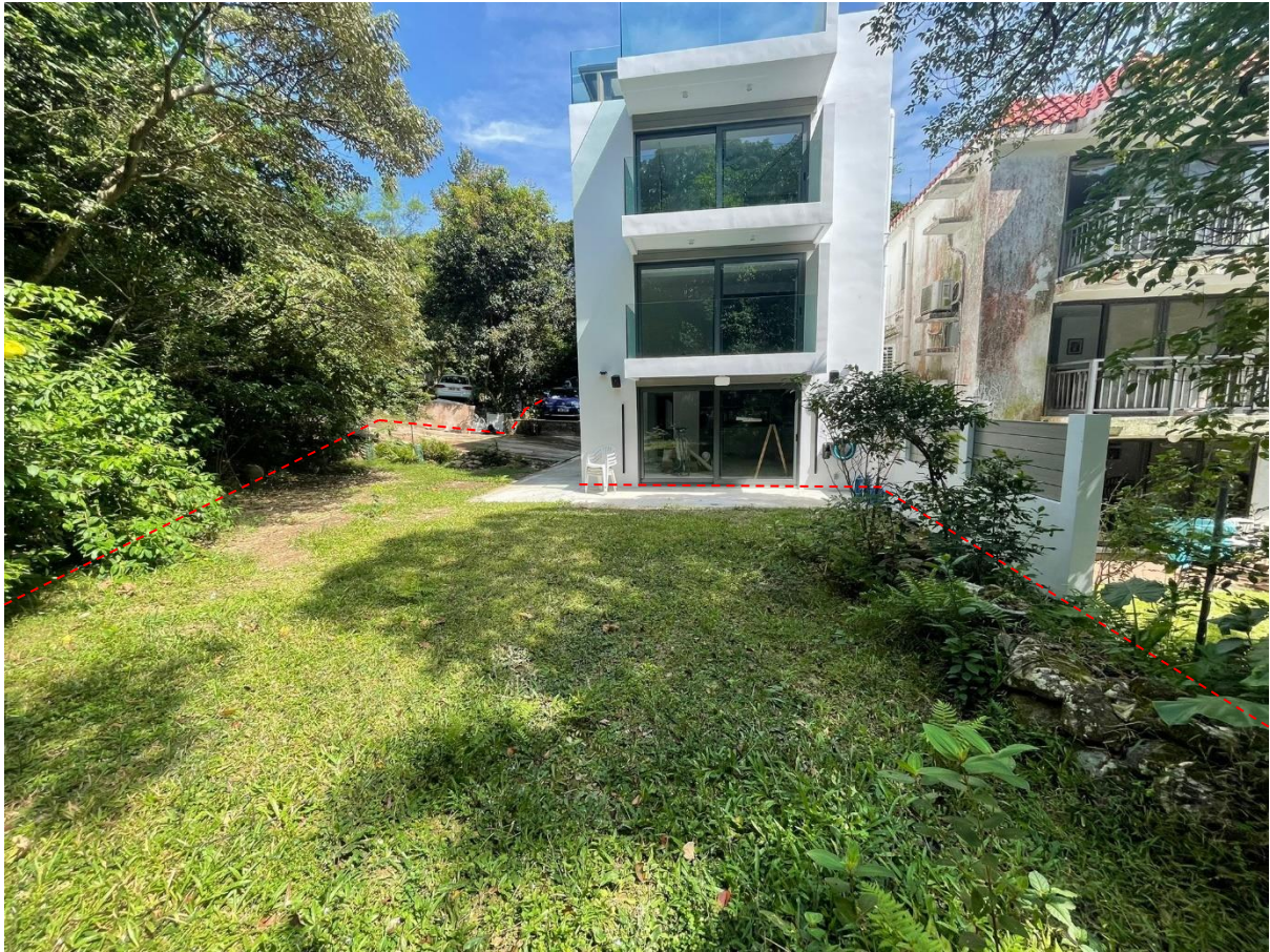
Photo 1: The photograph shows the existing grass on the site that will be retained. (Boundary line of the proposed STT are only indicative, please see the site plan for accurate boundary lines).