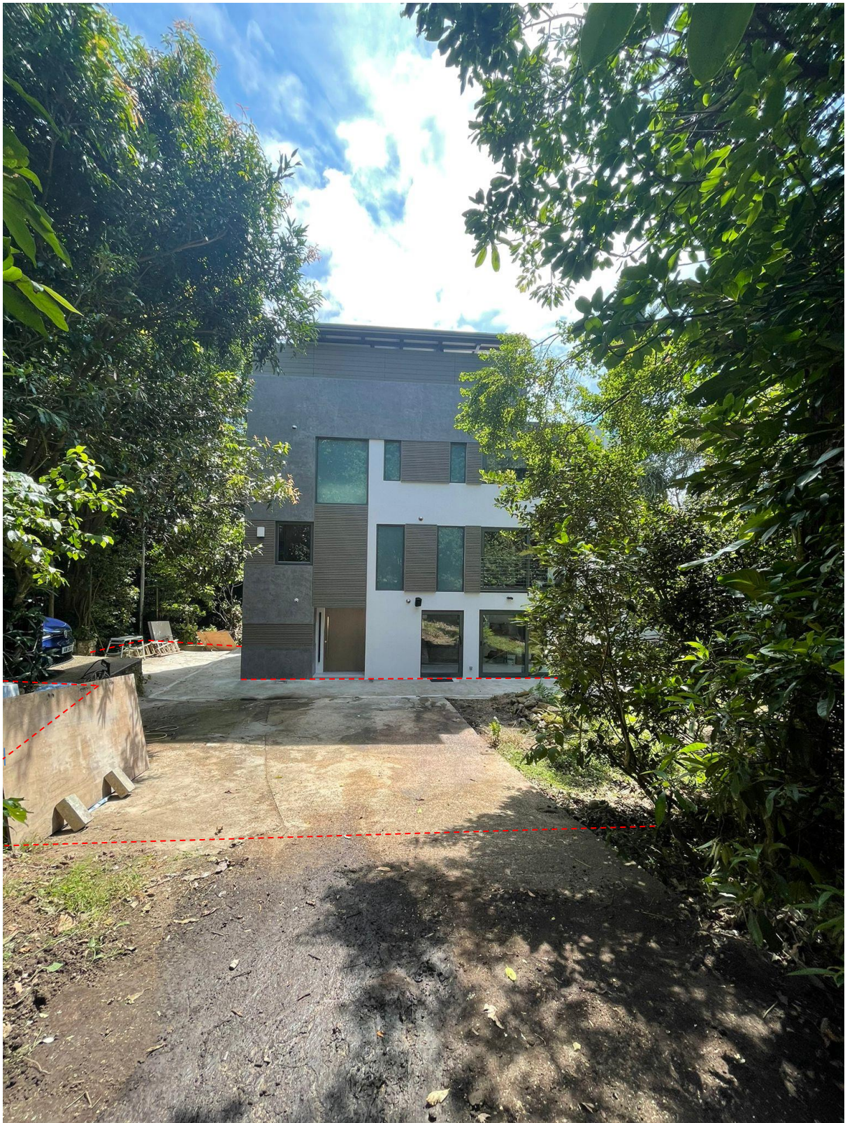
Photo 2: Show the existing concreted strip upon which the platform for the additional car park will be constructed. (Boundary line of the proposed STT are only indicative, please see the site plan for accurate boundary lines).