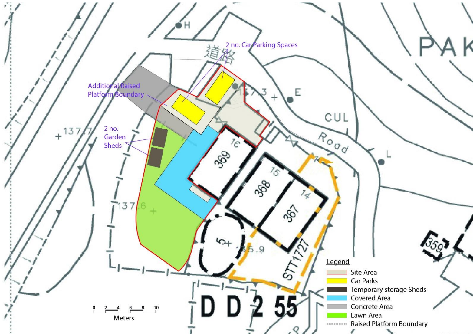
Plan 2: Shows the proposed garden layout, with the proposed grassed area and concreted area indicated (which would remain) as well as the location of the formation area for the proposed additional car park. The location of the sheds, the proposed tiled area and the covered area are also indicated.