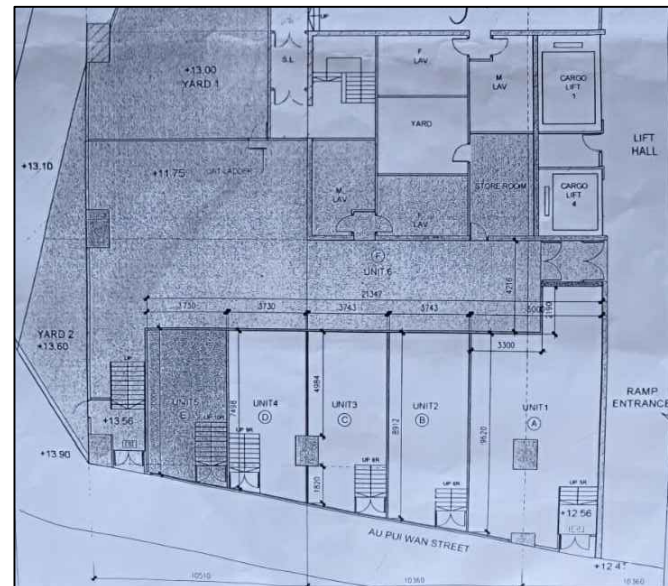
G/F COMMUNAL TOILET ROUTE PLAN (NOT TO SCALE)