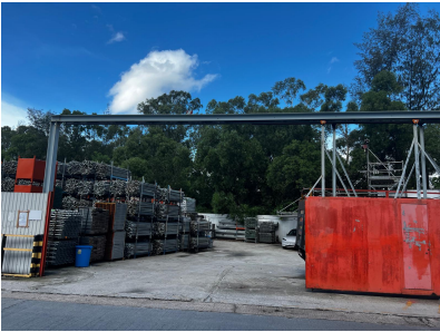
View 1 - Entrance/Exit