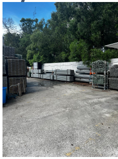
View 2 - Site Access Road towards to Maneuvring Point