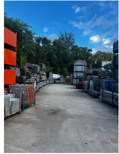
View 3 - Site Access Road