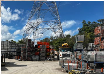
View of the heavy goods vehicle that used