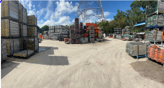
View 4 - Manoeuvring Point