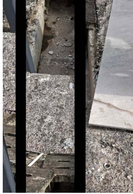
Water flow out