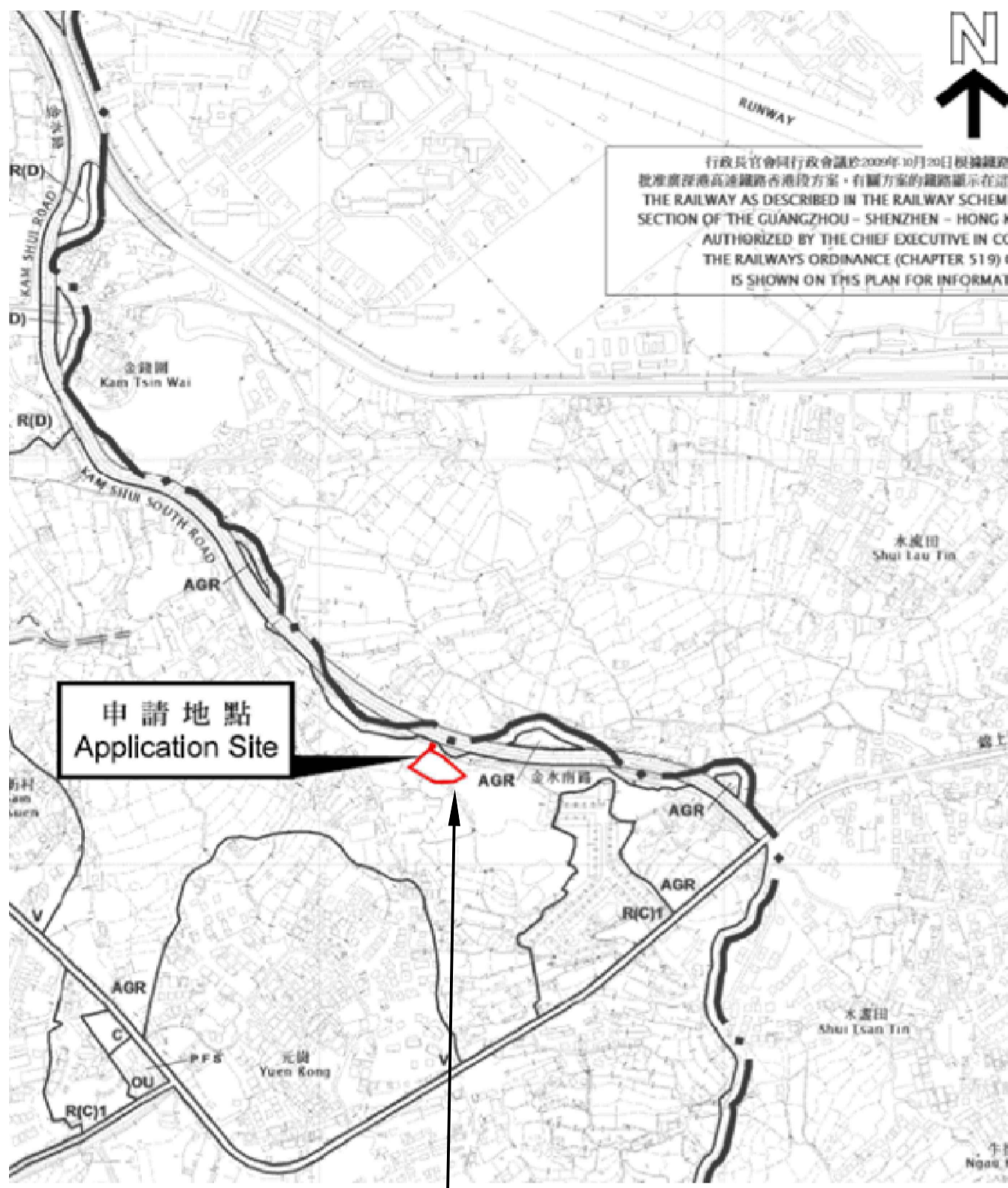
LOT 1185 S.E RP IN DD106, KAM TIN SOUTH BLOCK PLAN (N.T.S)