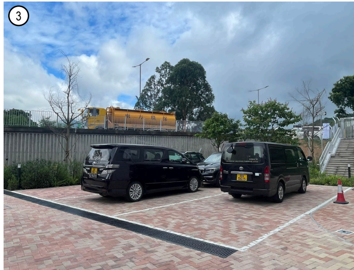
Heavy Goods Vehicle Loading & Unloading Bay