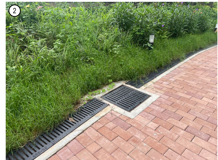
Compliance with Approval Condition (g) – The implemented drainage facilities on the site shall be maintained at all times during the planning approval period