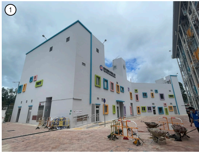
Amenity & E/M Building