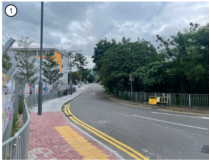
Compliance with Approval Condition (a) – No vehicle is allowed to queue back to or reverse onto/from public road at any time during the planning approval period