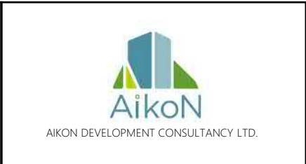
Figure: 1 Scale: Not to Scale Date: Oct 2024

Title: The Location Plan Ref.: ADCL/PLG-10298/R001/F001