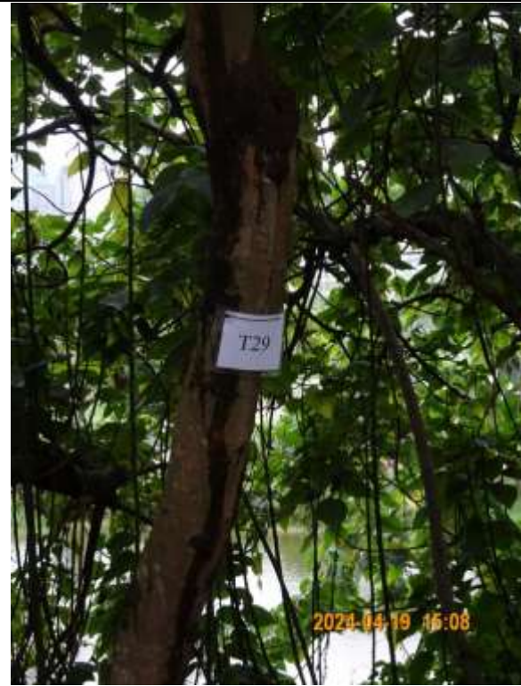
T029 – Tree tag