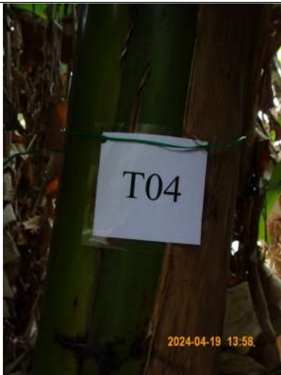
T004 – Tree tag