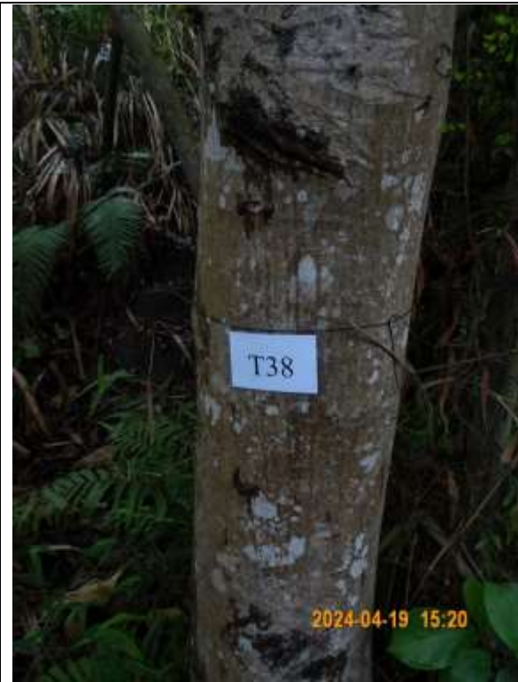
T038 – Tree tag