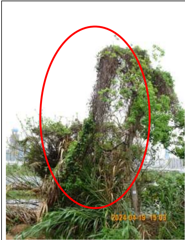
T025 – Heavily climbing plants