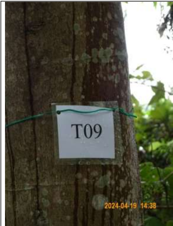
T009 – Tree tag