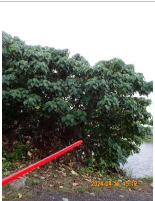
T032 – Overview