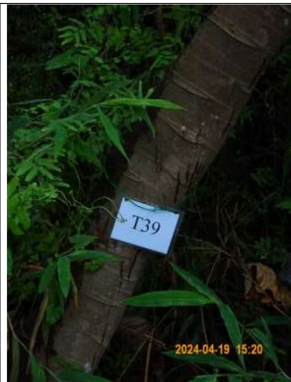
T039 – Tree tag