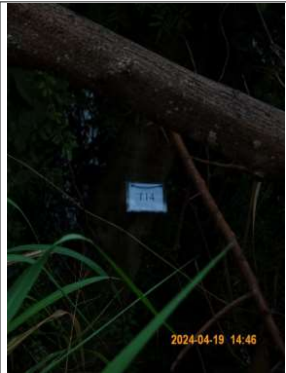
T014 – Tree tag