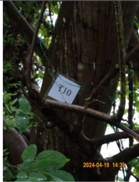
T010 – Tree tag