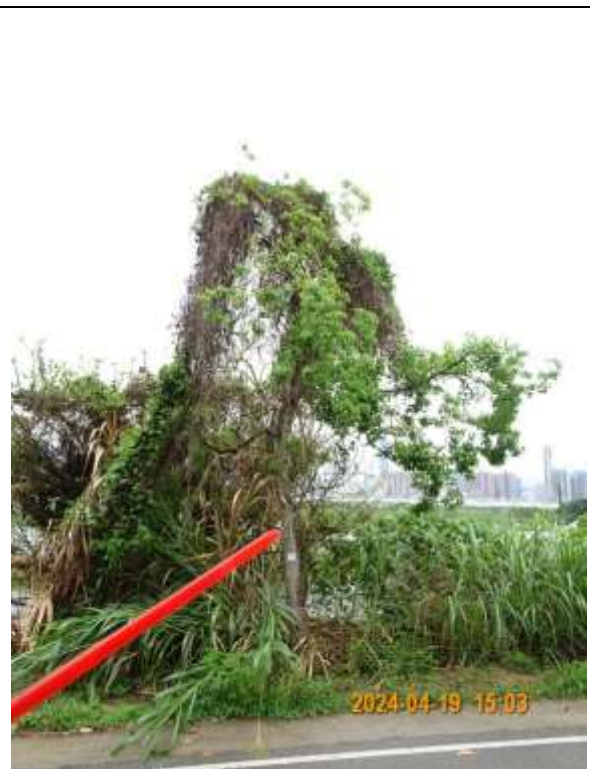
T025 – Overview