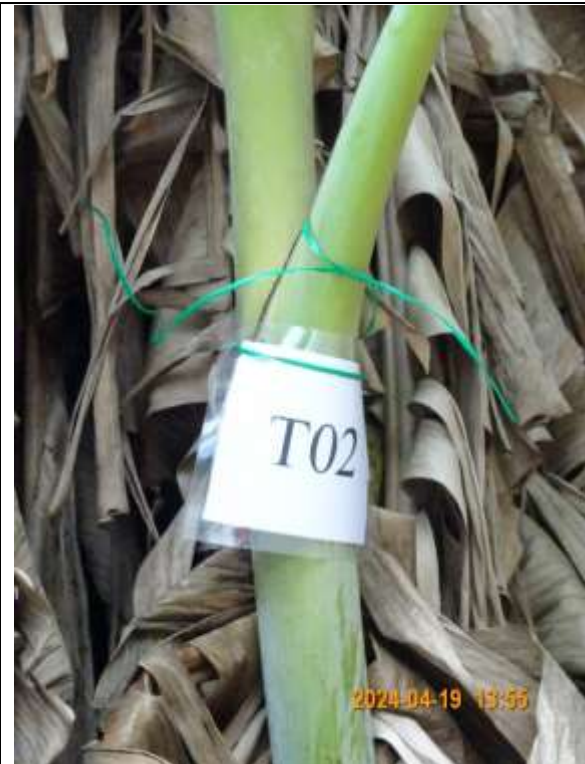
T002 – Tree tag