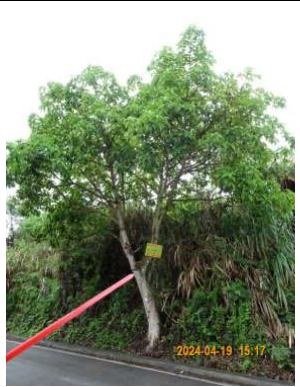
T035 – Overview