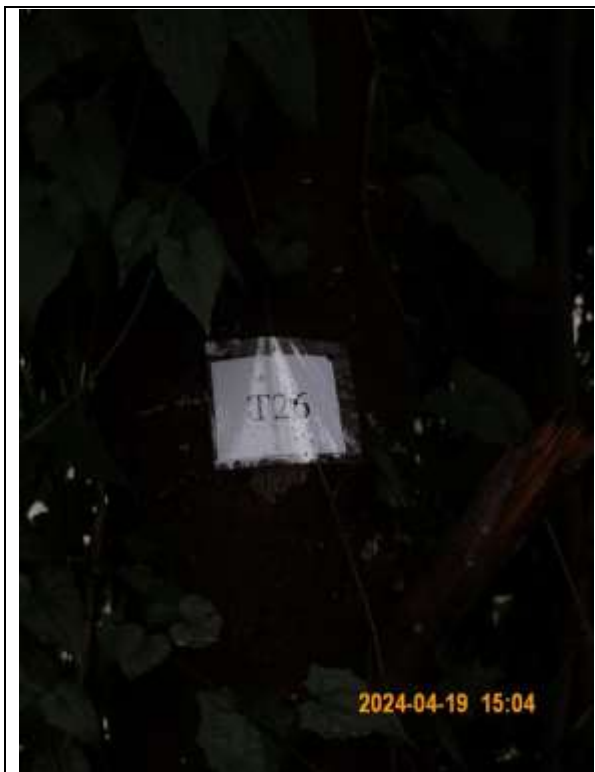
T026 – Tree tag