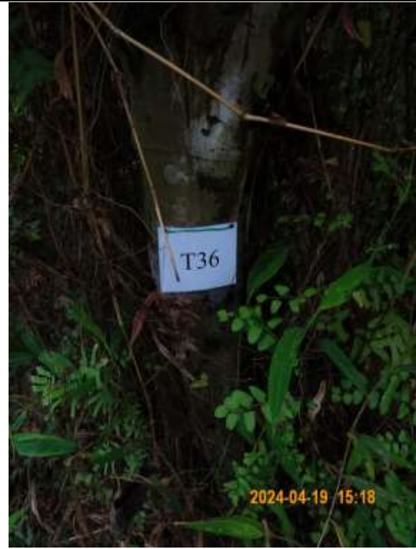
T036 – Tree tag