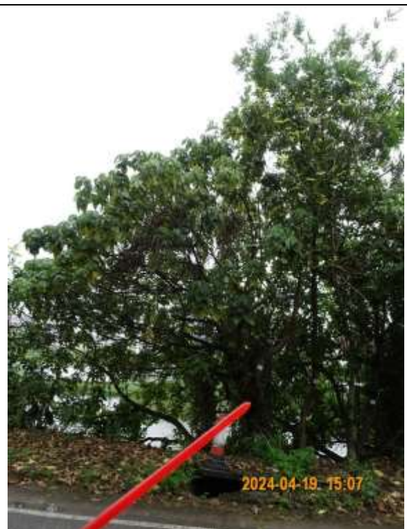
T028 – Overview