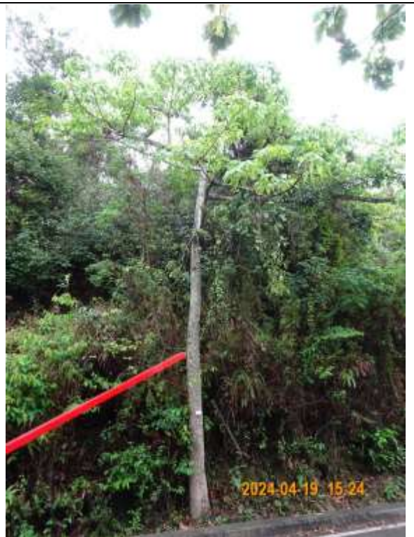
T042 – Overview