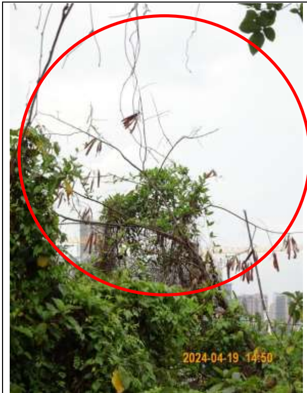
T015 – Serious dieback