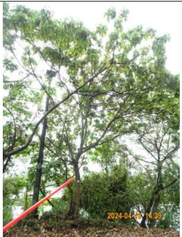
T009 – Overview