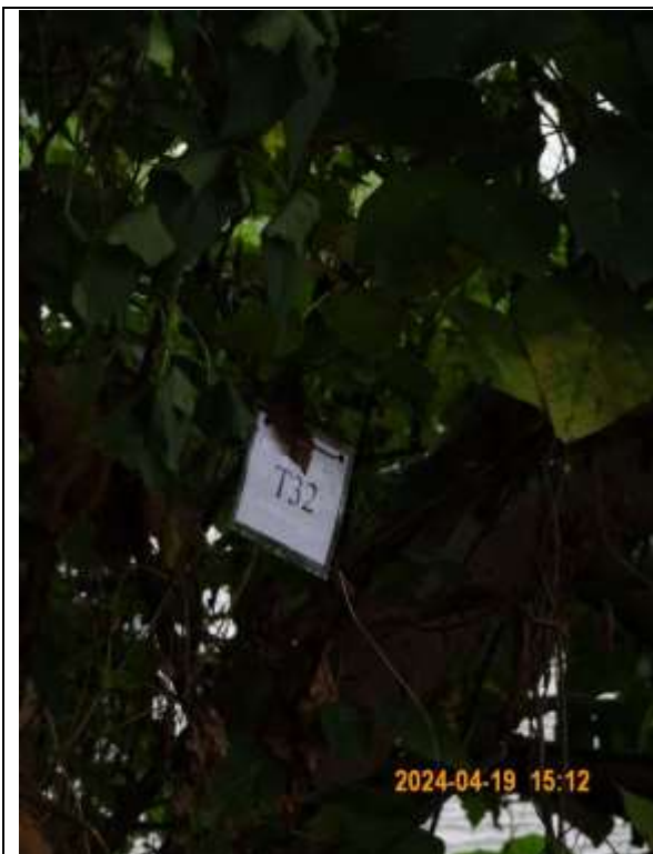
T032 – Tree tag