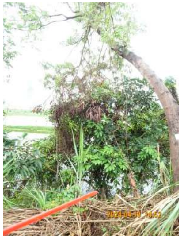
T016 – Overview