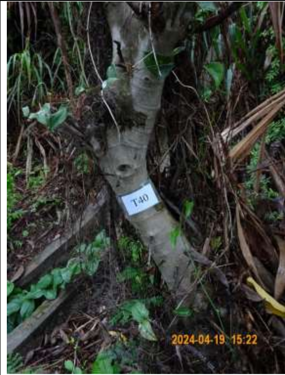
T040 – Tree tag