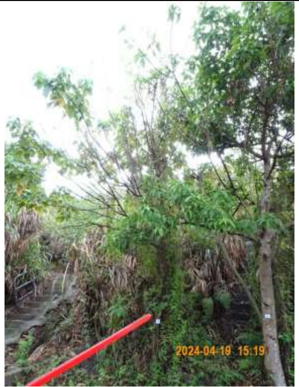
T036 – Overview