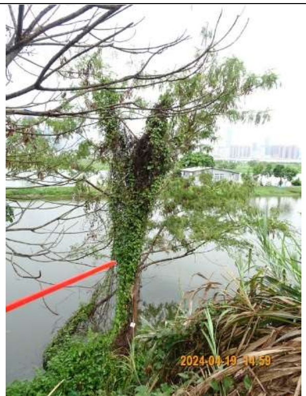
T022 – Overview