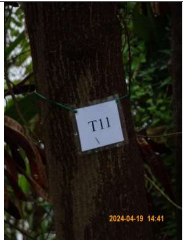
T011 – Tree tag