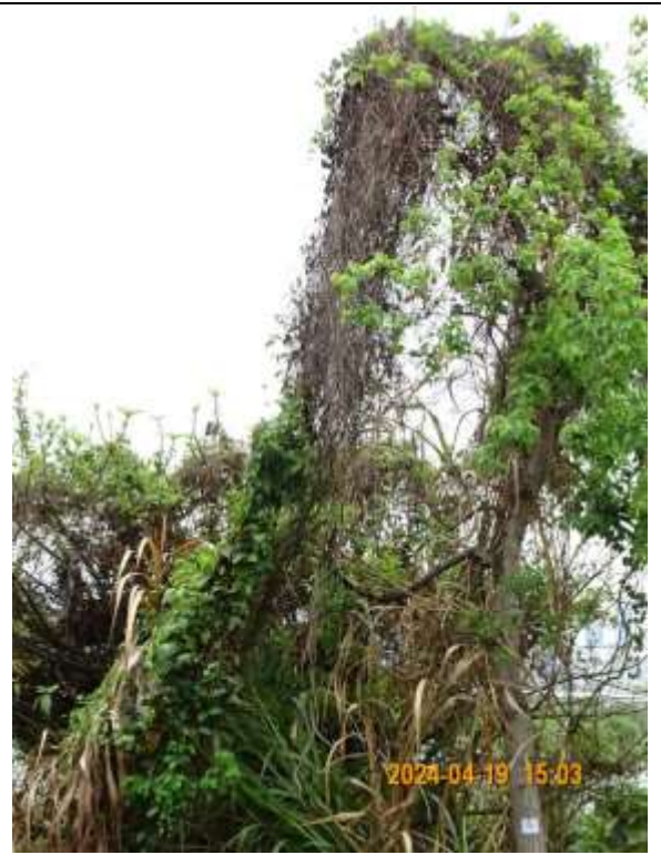
T025 – Closer view