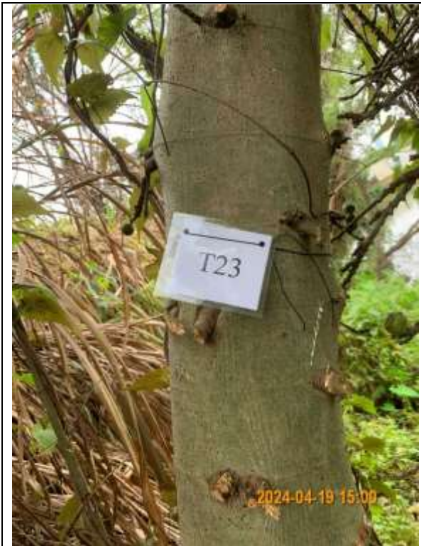
T023 – Tree tag