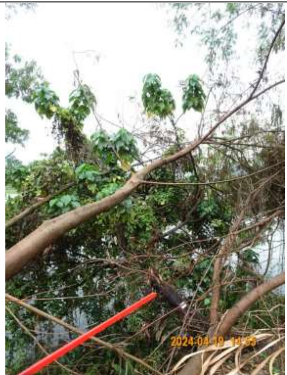
T019 – Overview