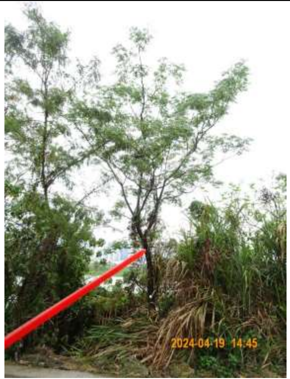
T013 – Overview