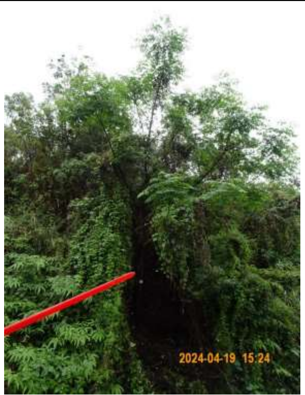
T041 – Overview