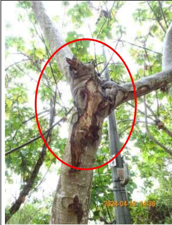
T008 – Wound wood