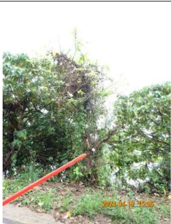
T027 – Overview