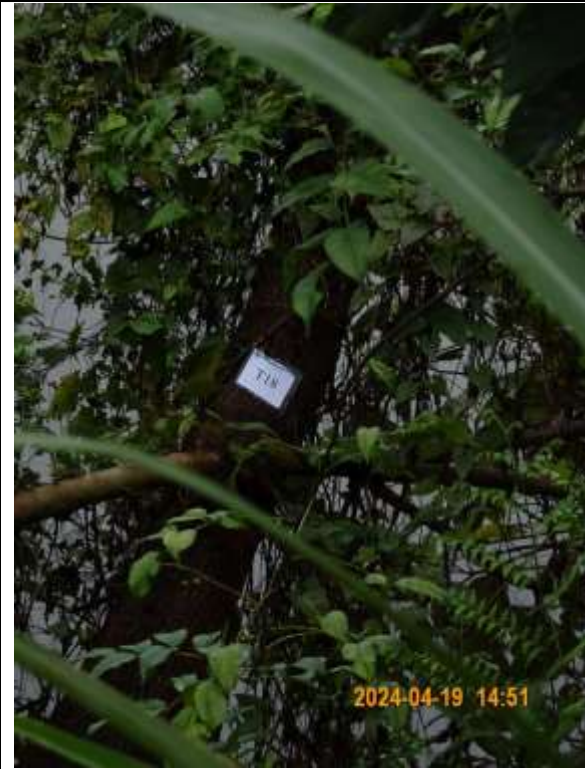
T018 – Tree tag