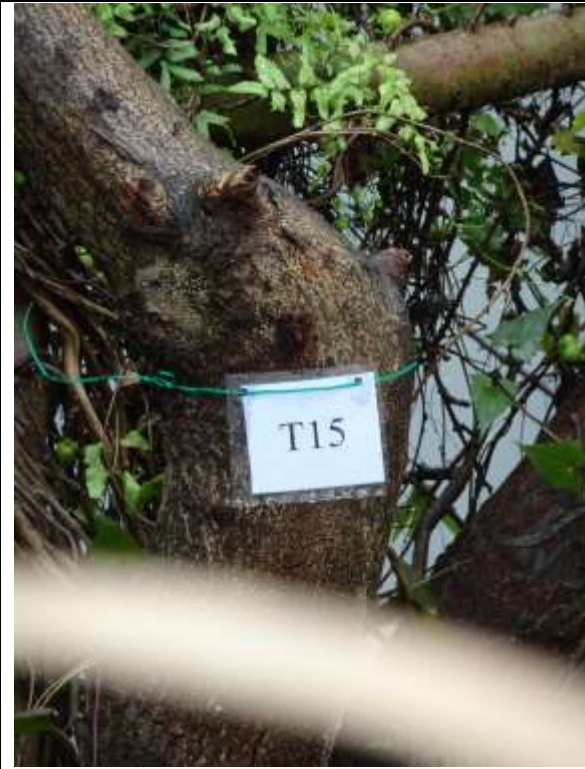
T015 – Tree tag