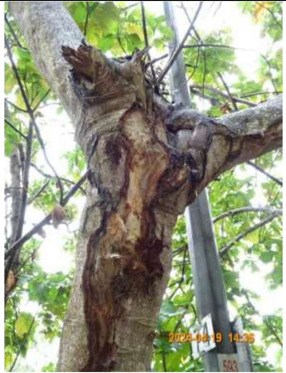
T008 – Closer view