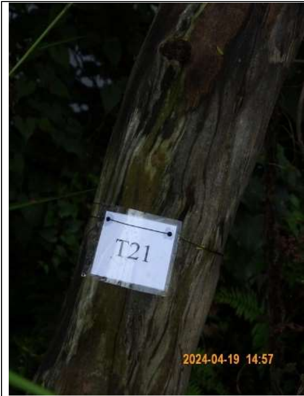
T021 – Tree tag