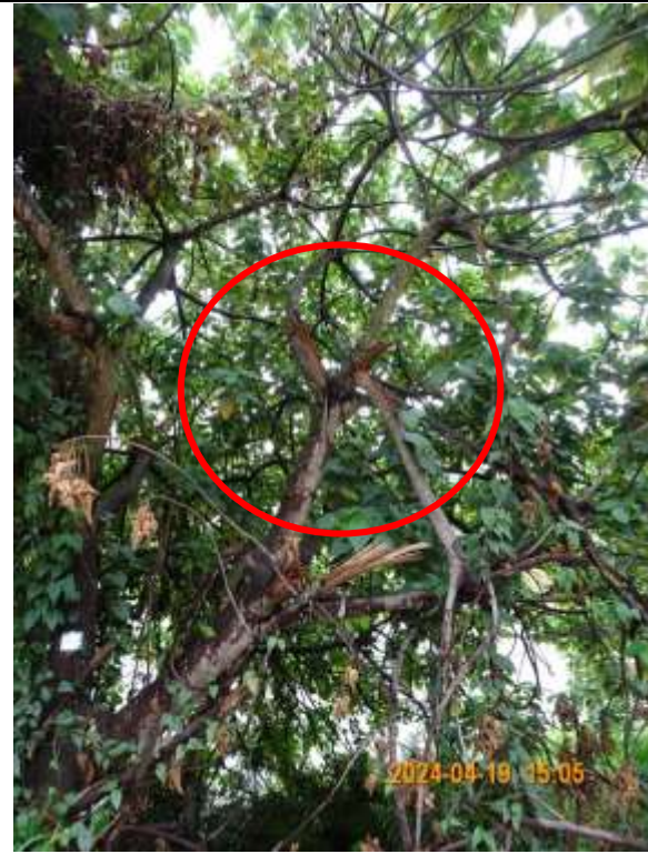
T026 – Broken branch