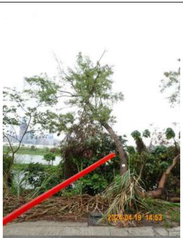
T017 – Overview