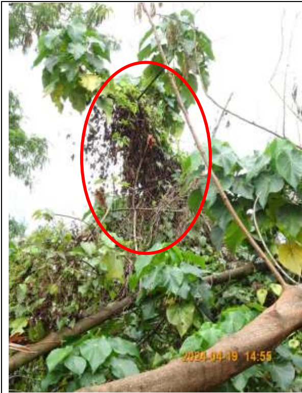
T019 – Heavily climbing plants