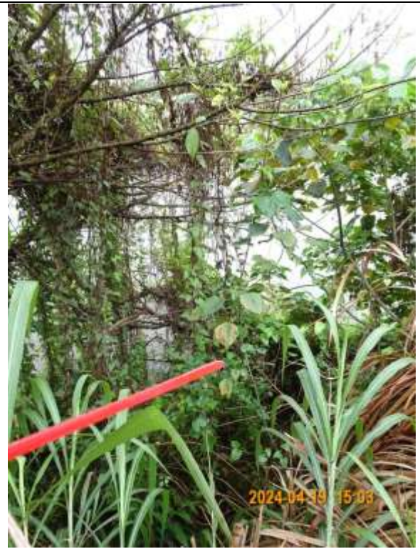
T024 – Overview