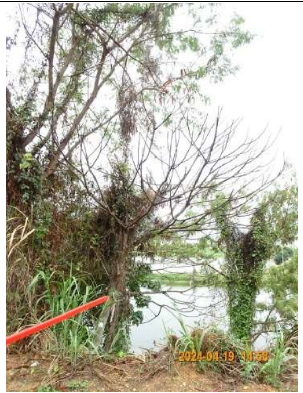
T021 – Overview