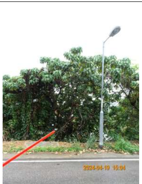
T026 – Overview