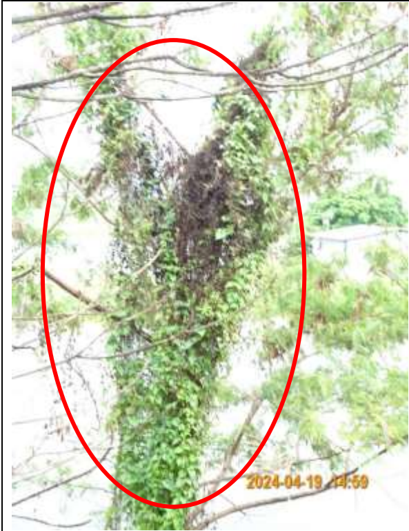
T022 – Heavily climbing plants