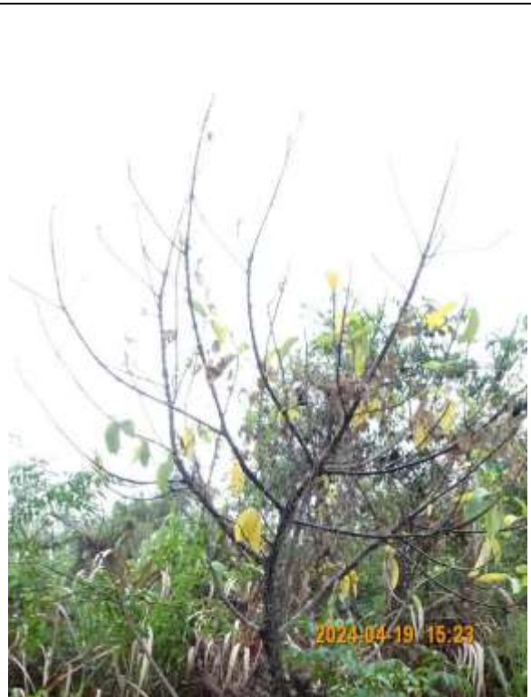
T040 – Closer view