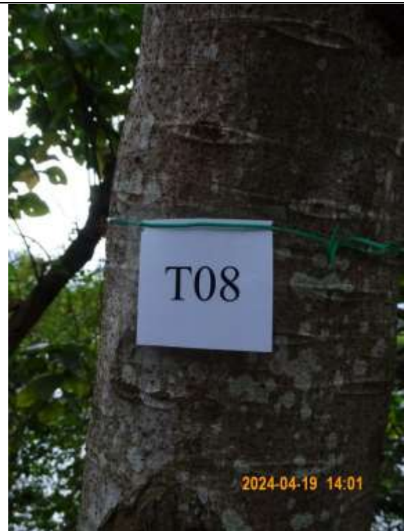
T008 – Tree tag