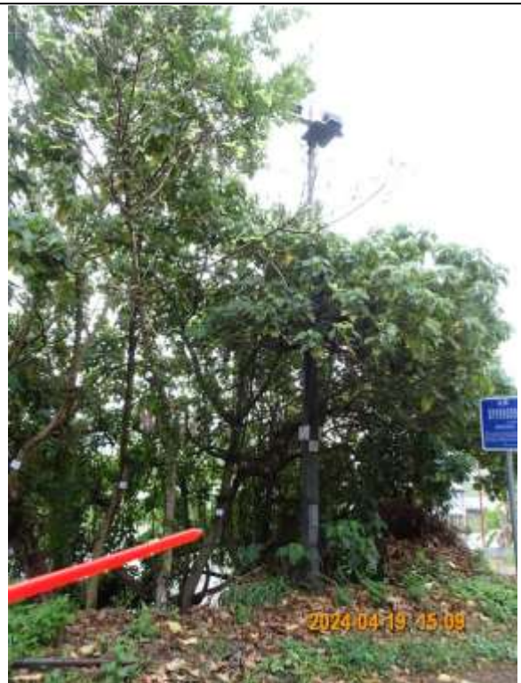
T030 – Overview