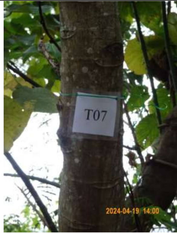
T007 – Tree tag