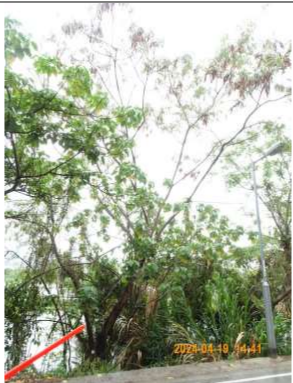
T011 – Overview