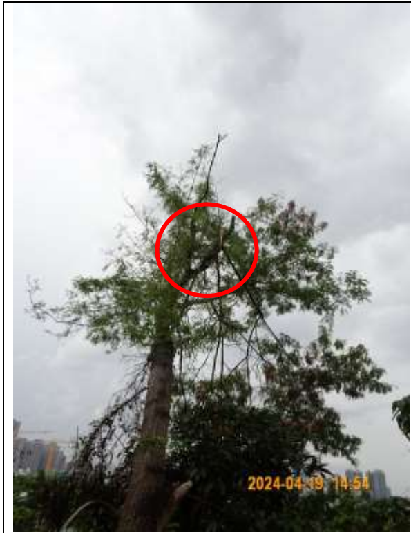
T017 – Broken branch