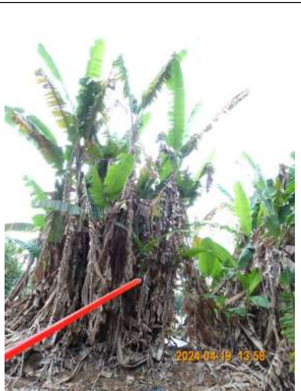
T004 – Overview