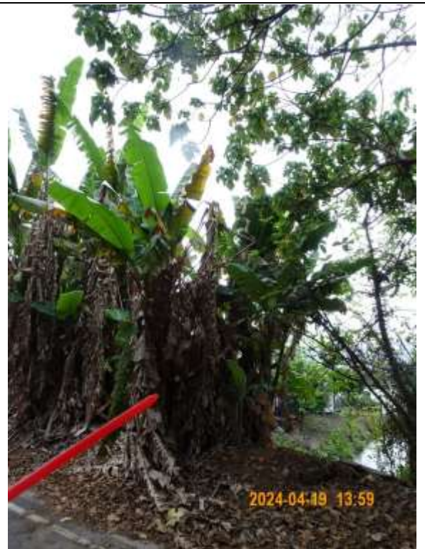
T005 – Overview