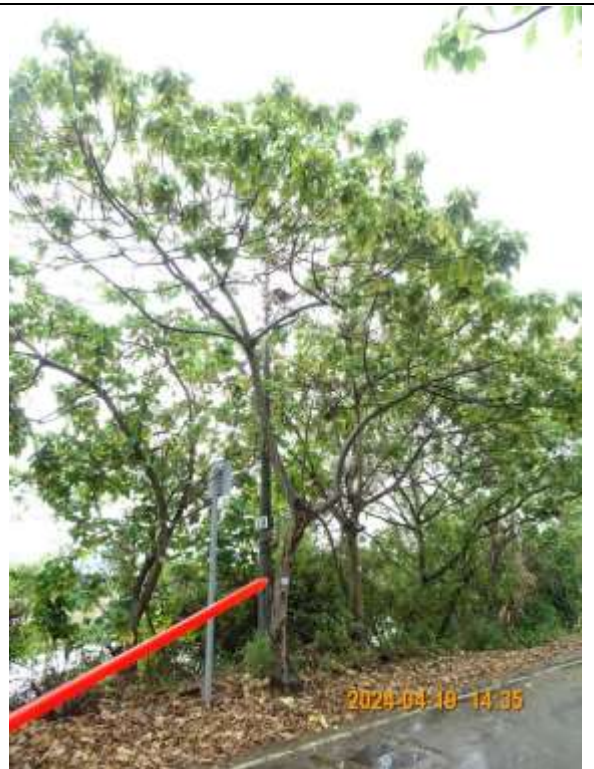
T008 – Overview