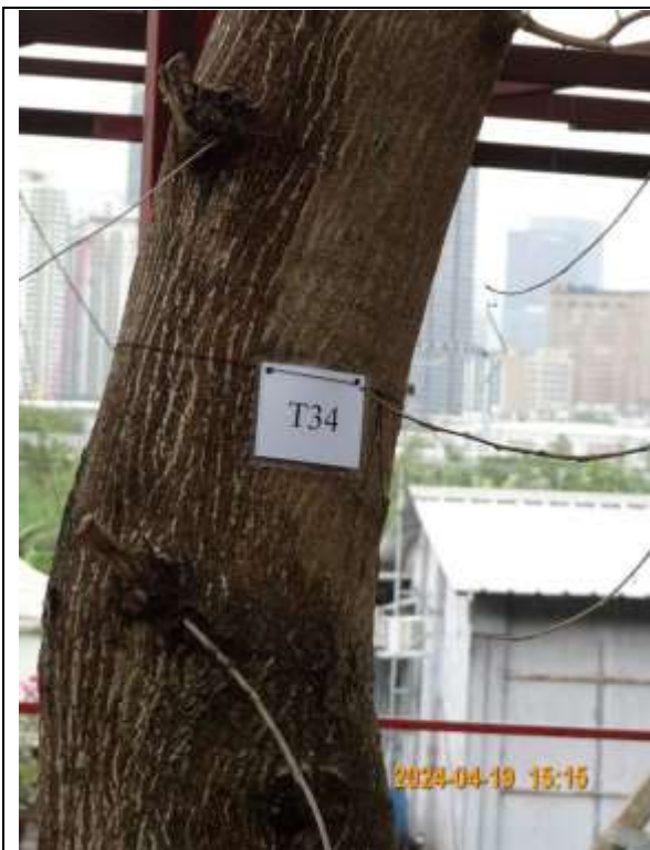
T034 – Tree tag