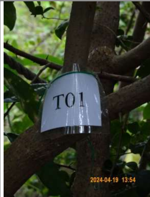
T001 – Tree tag