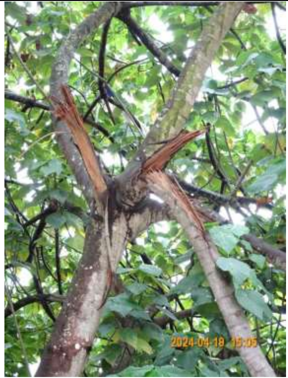
T026 – Closer view