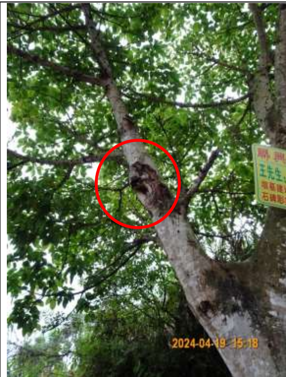
T035 – Wound wood