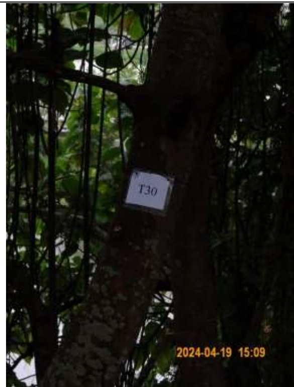
T030 – Tree tag