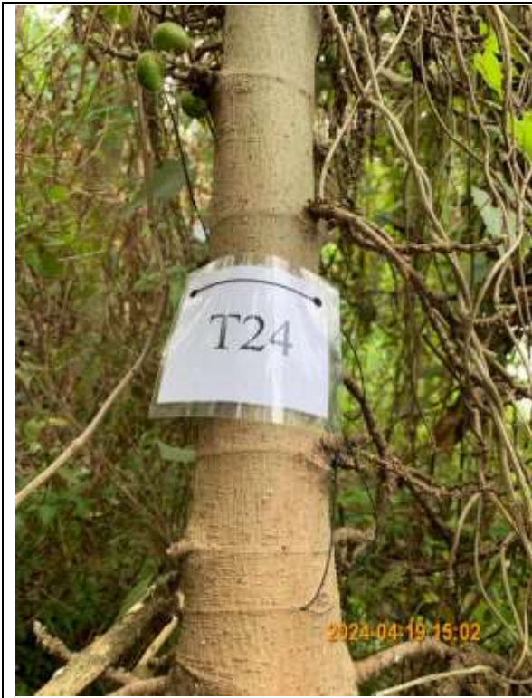
T024 – Tree tag