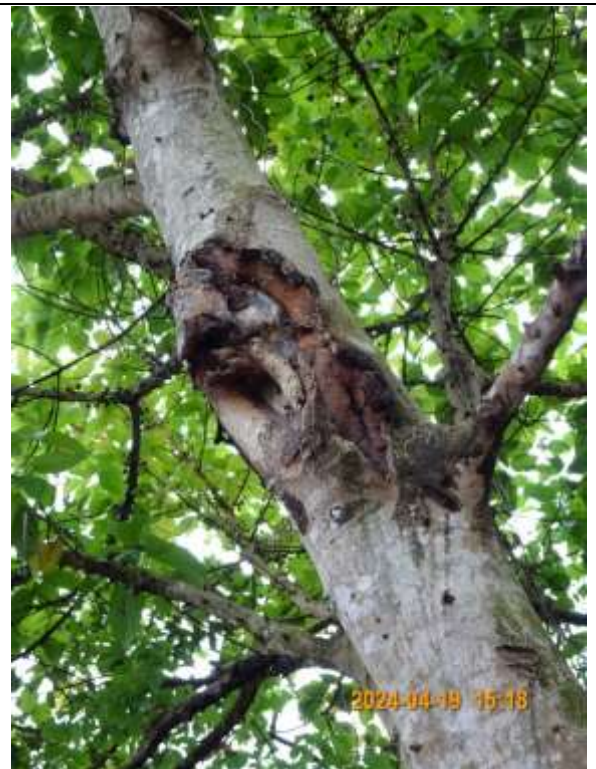
T035 – Closer view