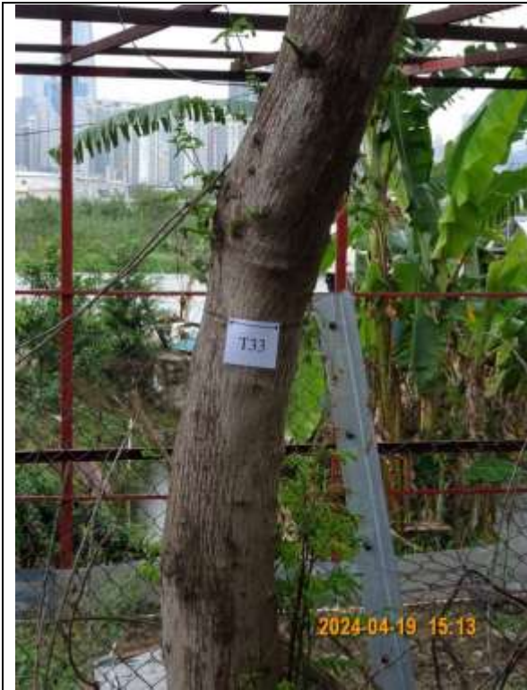
T033 – Tree tag