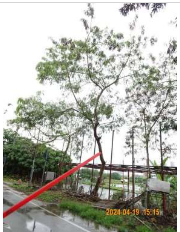
T034 – Overview