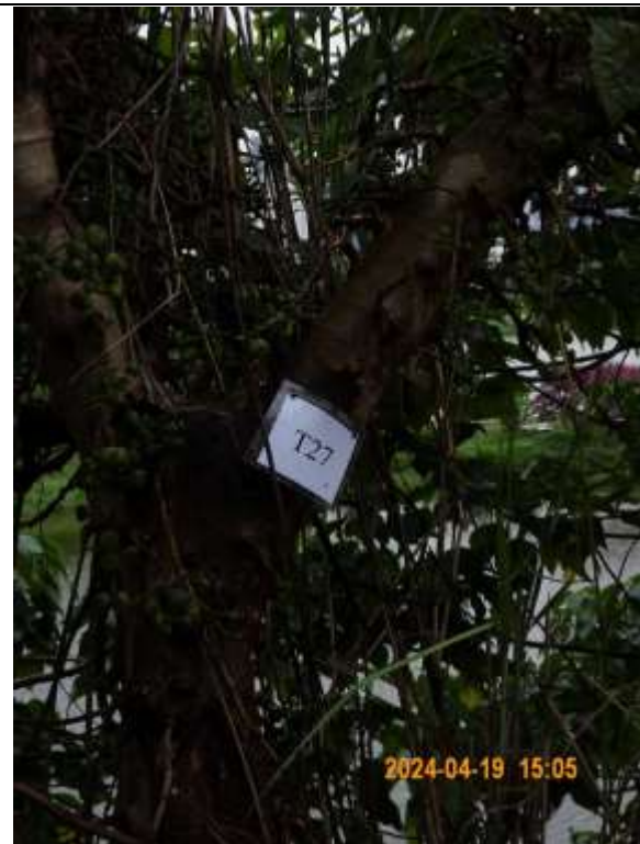
T027 – Tree tag