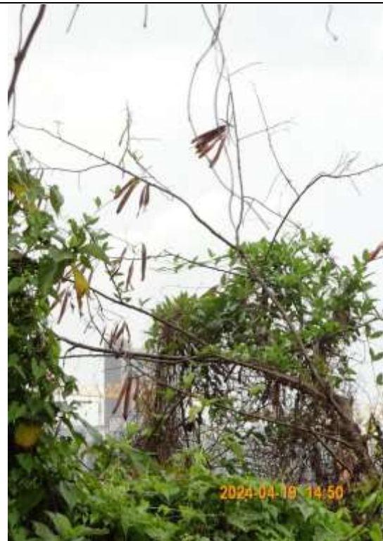
T015 – Closer view