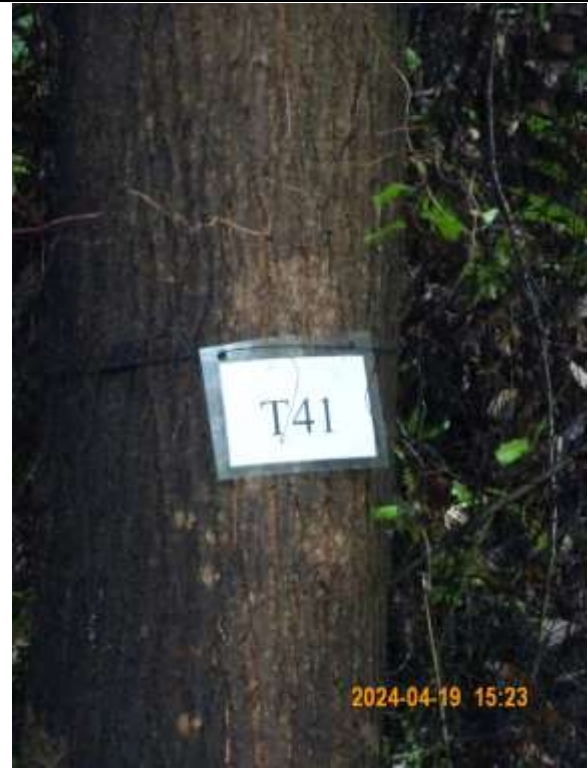
T041 – Tree tag