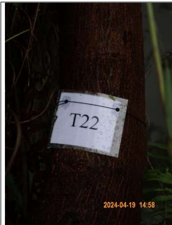
T022 – Tree tag