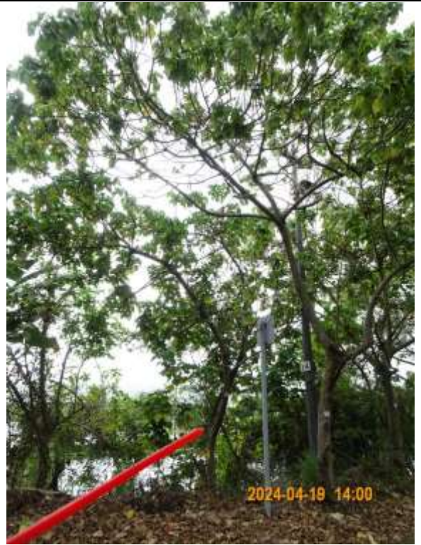
T007 – Overview