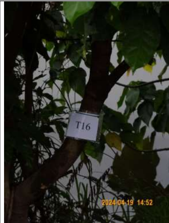
T016 – Tree tag