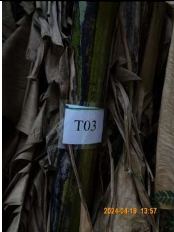
T003 – Tree tag