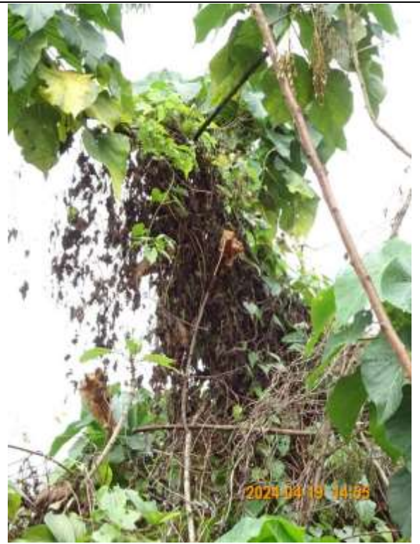
T019 – Closer view