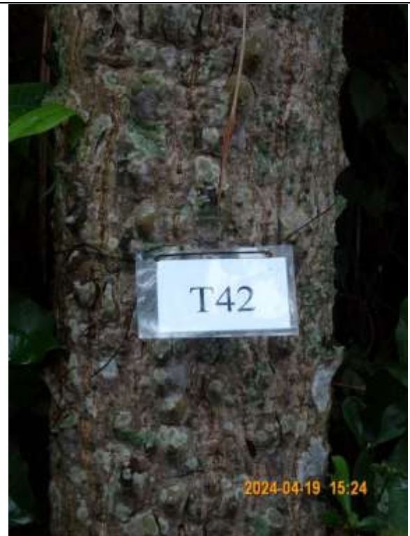
T042 – Tree tag