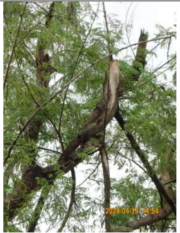
T017 – Closer view