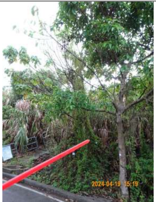
T037 – Overview