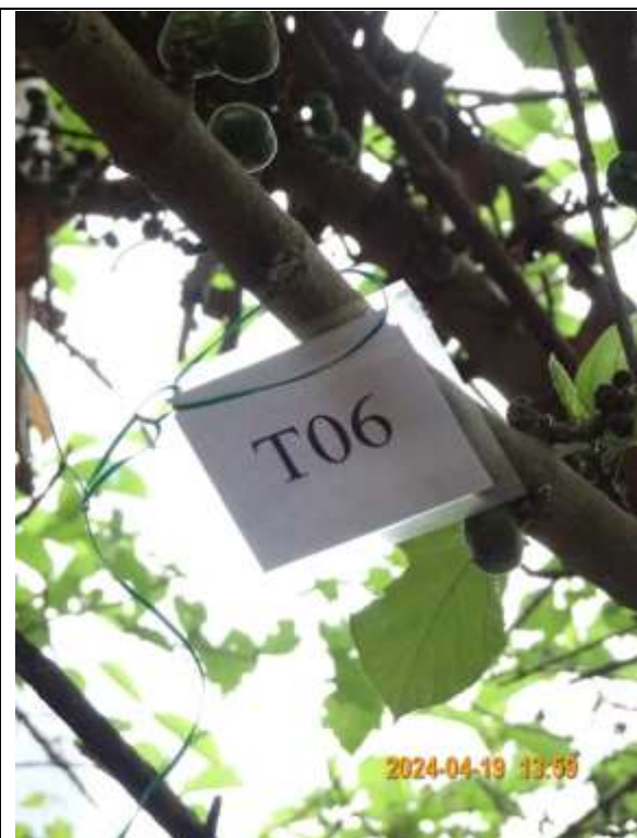
T006 – Tree tag