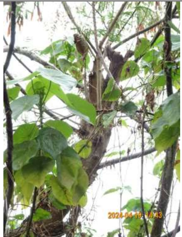
T011 – Closer view