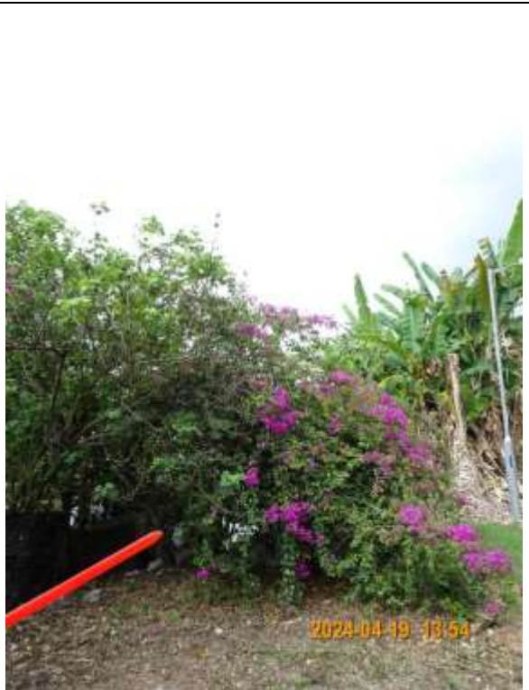
T001 – Overview