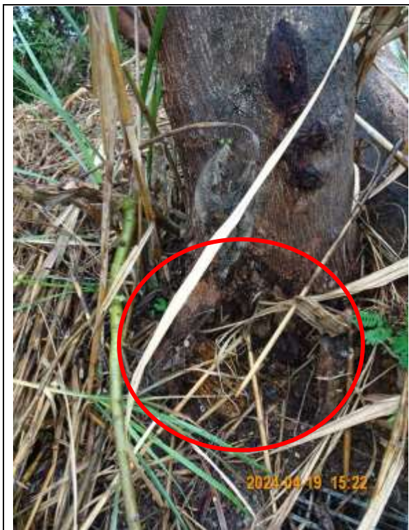
T017 – Decay basal trunk