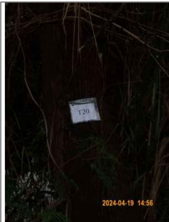
T020 – Tree tag