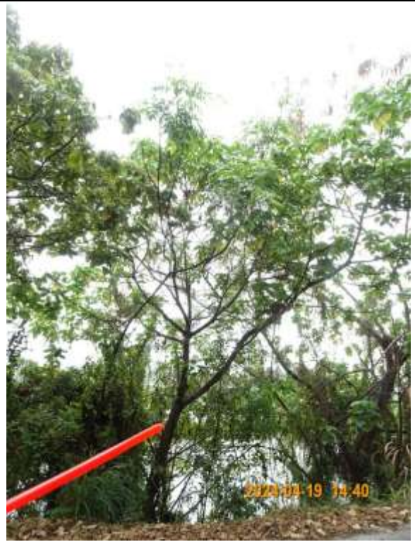
T010 – Overview