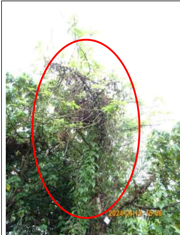
T027 – Heavily climbing plants