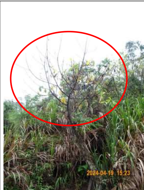
T040 – Serious dieback