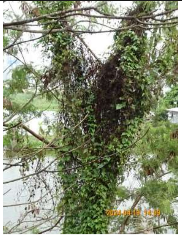
T022 – Closer view