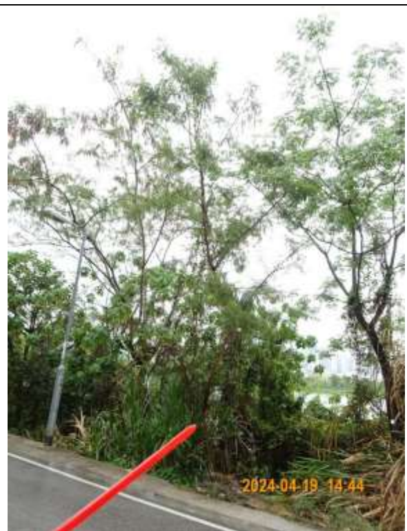
T012 – Overview