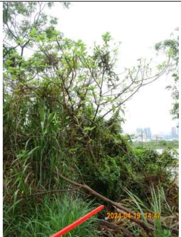
T014 – Overview