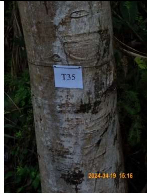
T035 – Tree tag