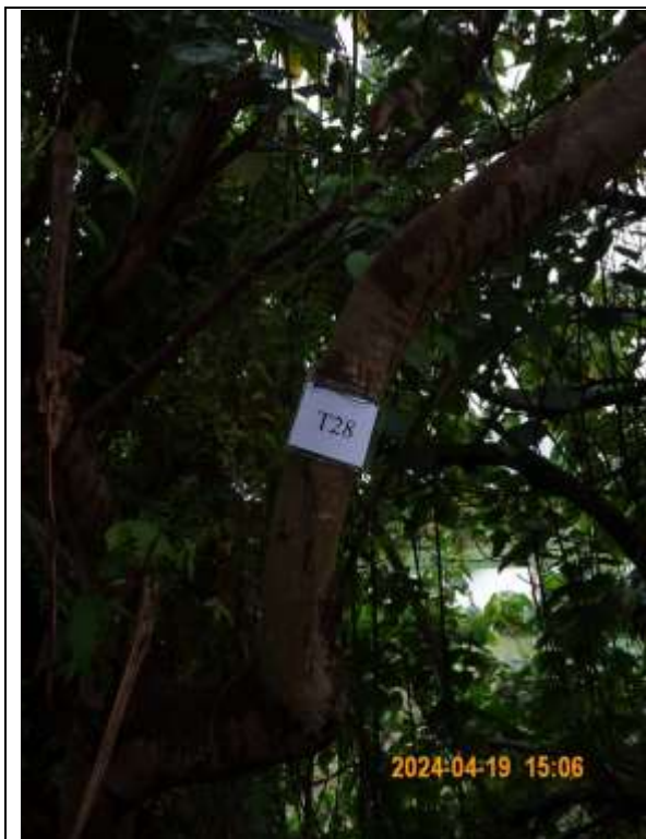
T028 – Tree tag