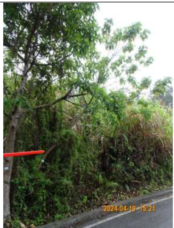
T039 – Overview