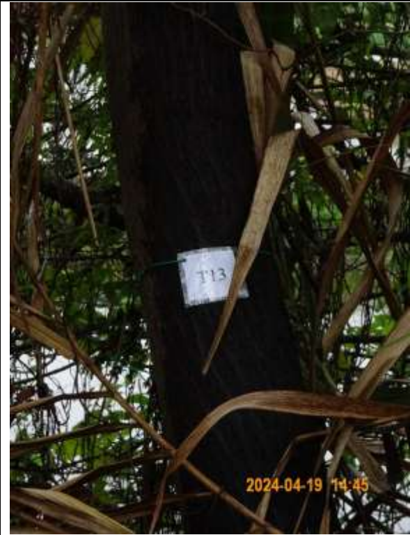
T013 – Tree tag