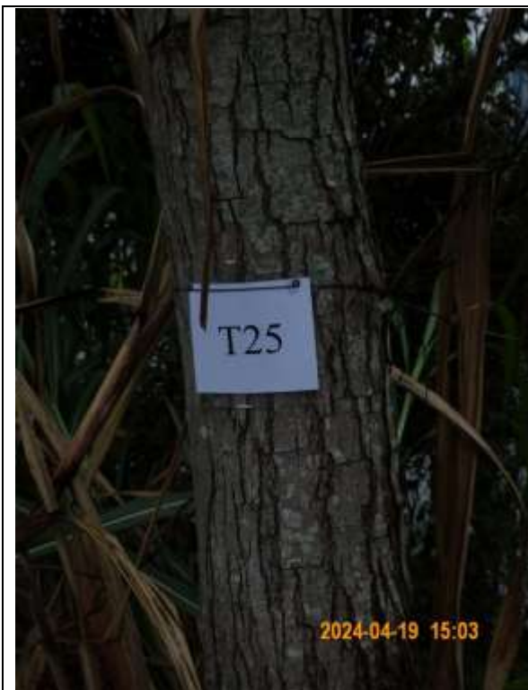
T025 – Tree tag