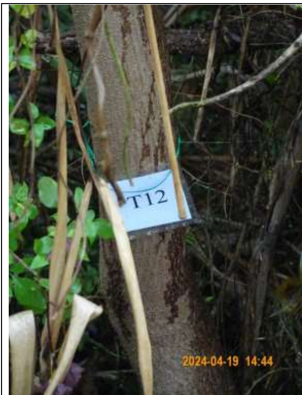
T012 – Tree tag