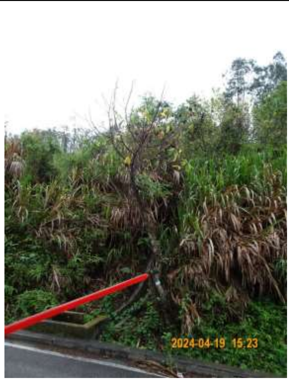
T040 – Overview