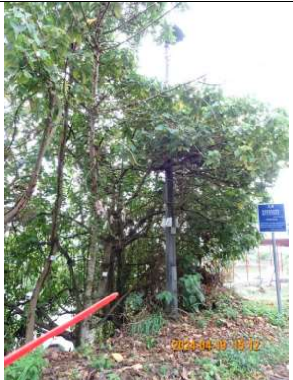
T031 – Overview