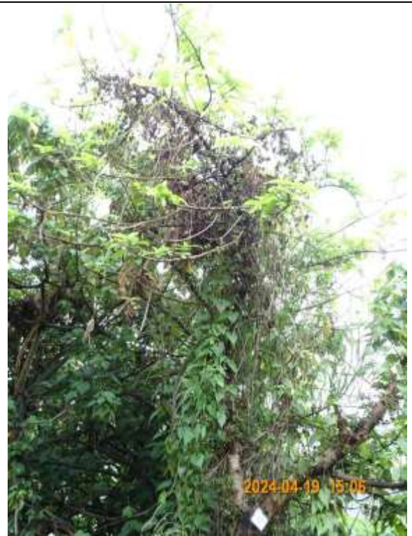
T027 – Closer view