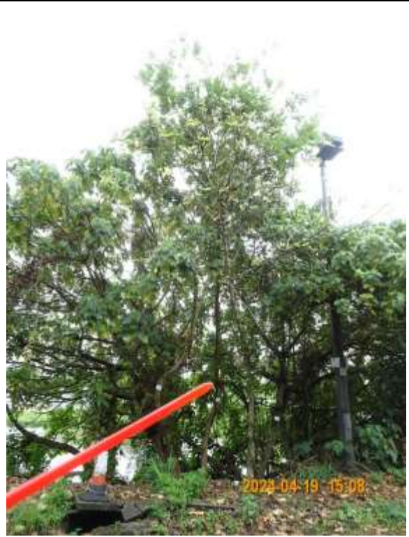
T029 – Overview