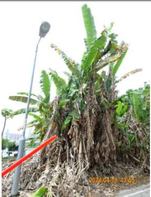
T002 – Overview