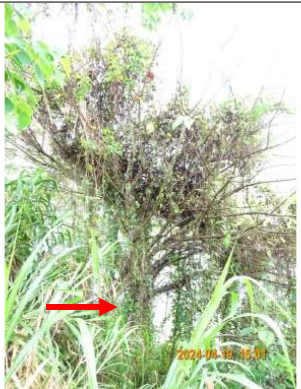
T023 – Overview