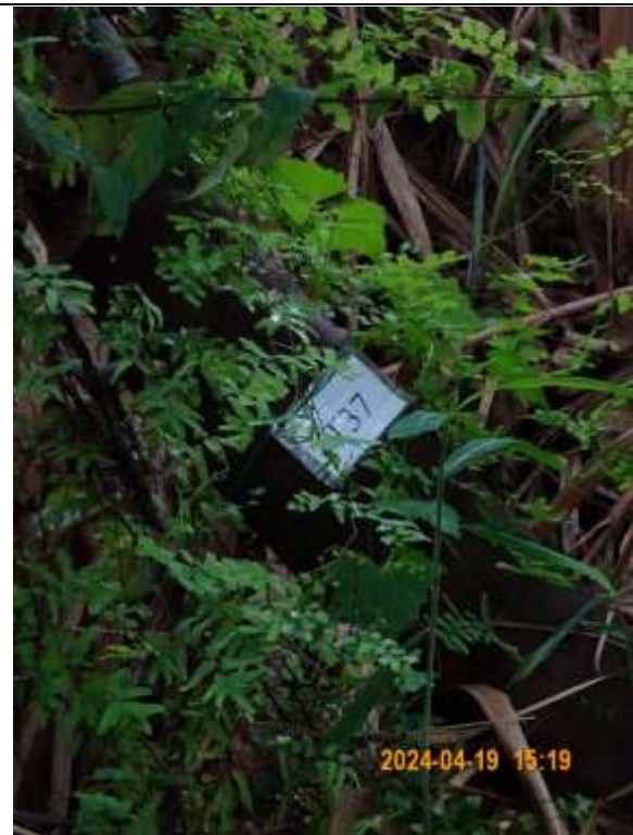
T037 – Tree tag