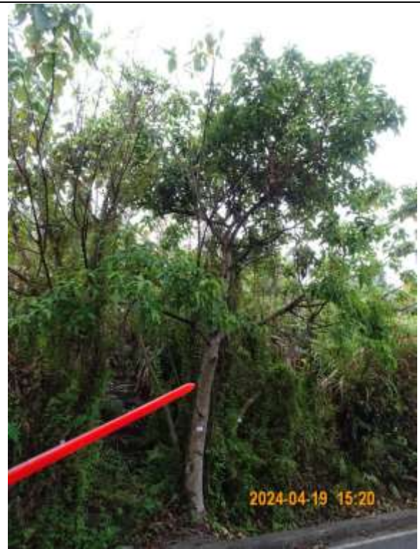
T038 – Overview