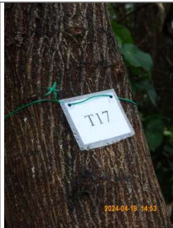
T017 – Tree tag