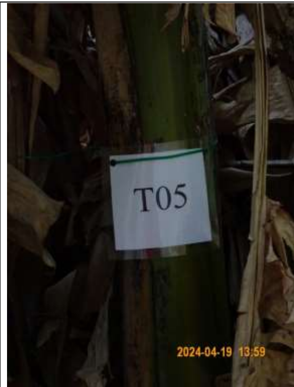
T005 – Tree tag