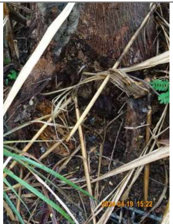
T017 – Closer view