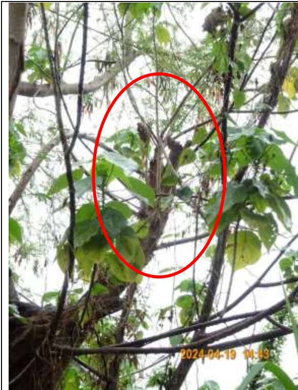
T011 – Broken branch