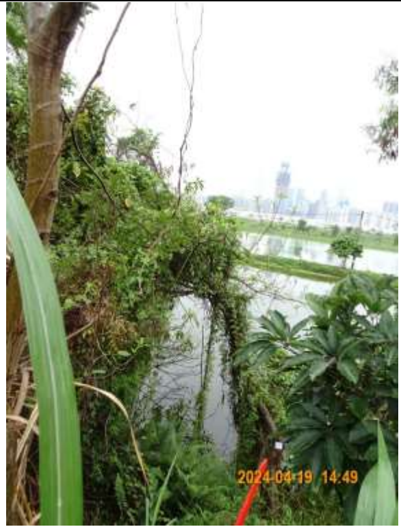
T015 – Overview