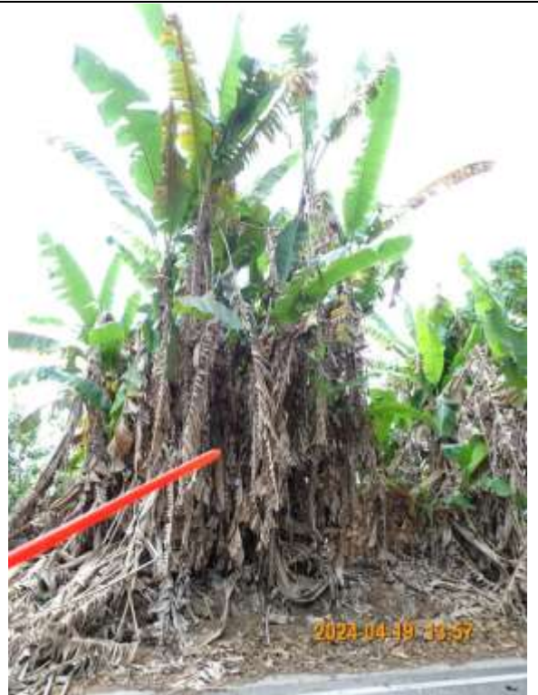
T003 – Overview