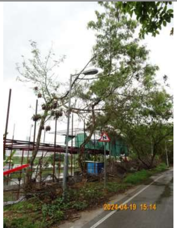
T033 – Overview