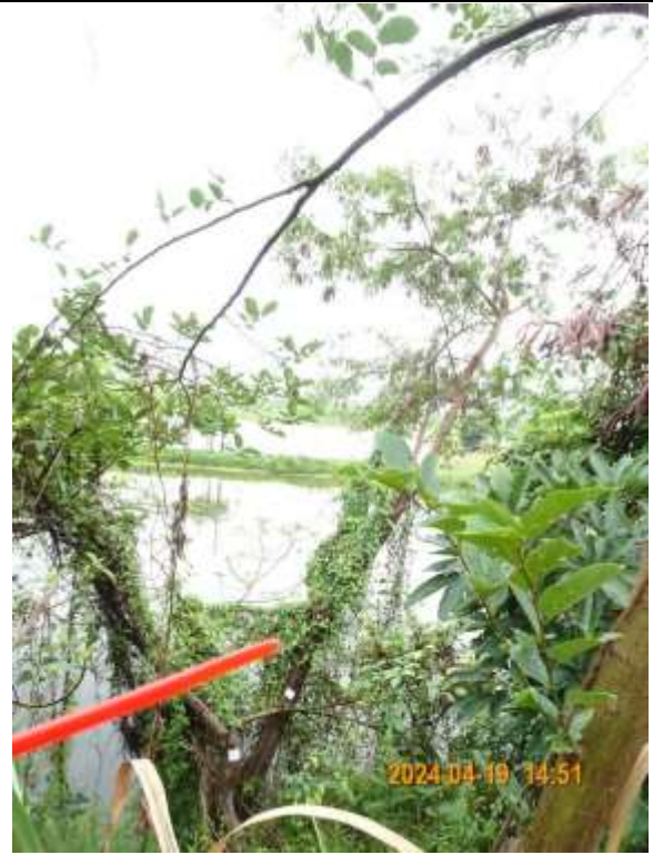
T018 – Overview