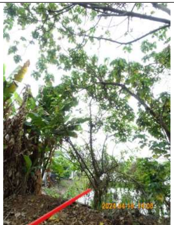
T006 – Overview