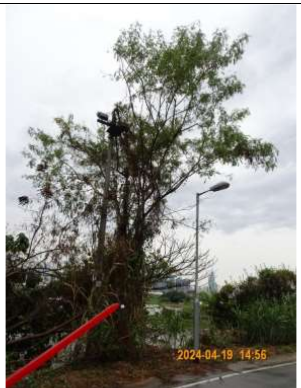
T020 – Overview