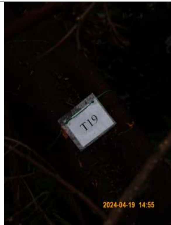
T019 – Tree tag