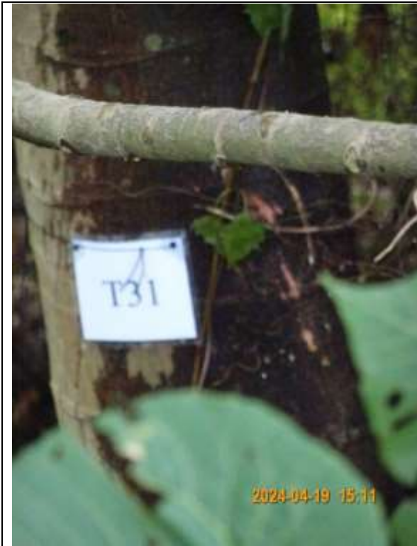
T031 – Tree tag