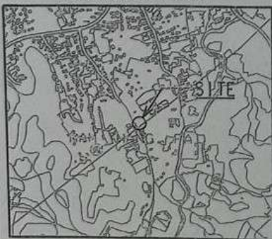
SCALE 1:20 000