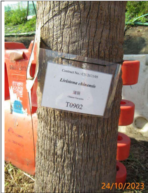
Tree tag T0902