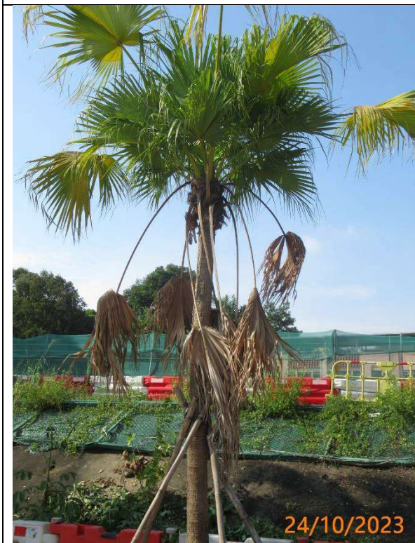
Dead fronds T0903