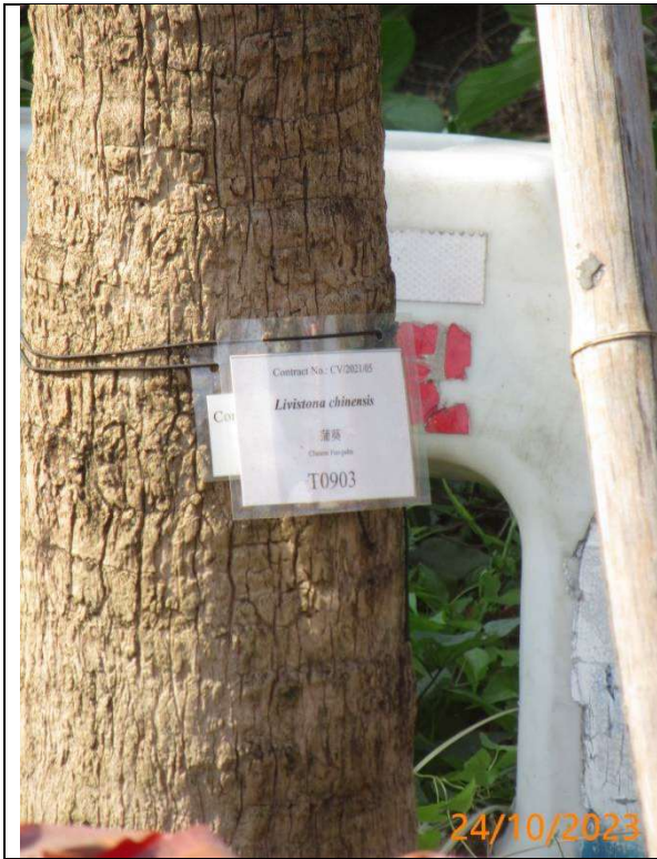
Tree tag T0903