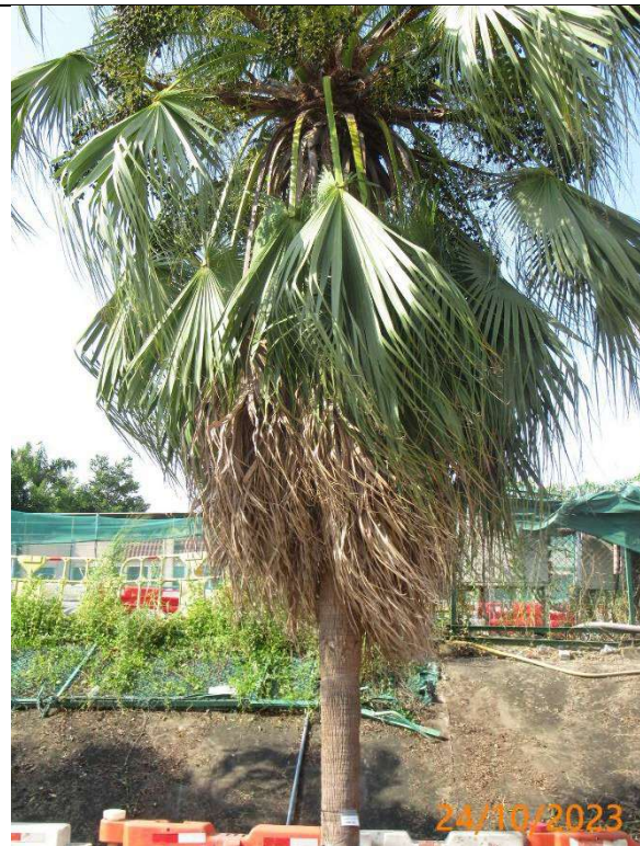
Dead fronds T0902