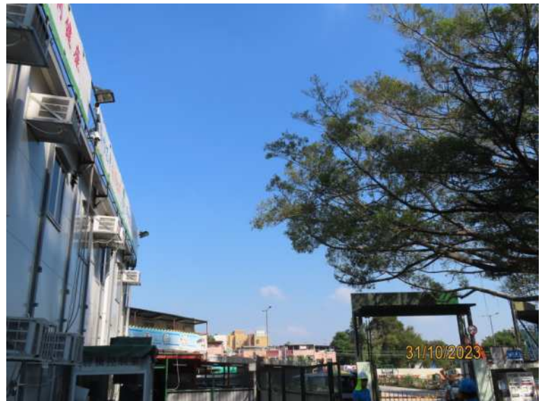
T0036_CrownView _LowerCrown (2)