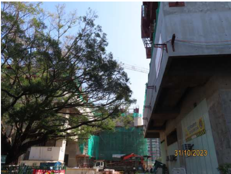
T0036_CrownView _LowerCrown (1)