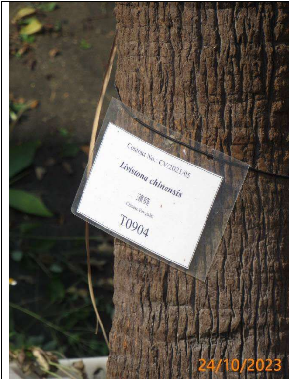
Tree tag T0904