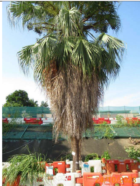
Dead fronds T0904